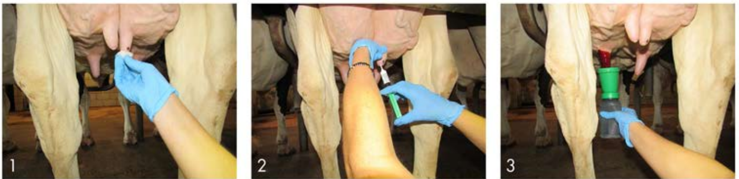
Figure 2. Aseptic administration of an internal teat sealant.