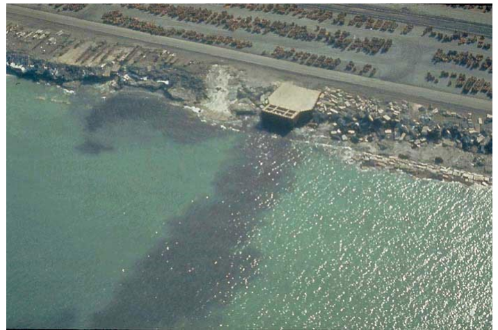
Figure 2. Industrial pollution along Calumet River.

Everyday citizens can take action to protect the water resources where they live. Collectively, citizens will be the ones to influence water policy, water quality, and the water budget. You can get involved by staying informed, protecting water resources, making others aware, participating in water resource conservation groups, monitoring the water resources in your area, and contacting government representatives and policymakers about these issues.