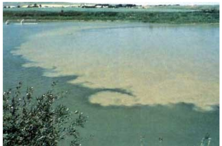
Figure 3. Sediment runoff from adjacent land in water body.