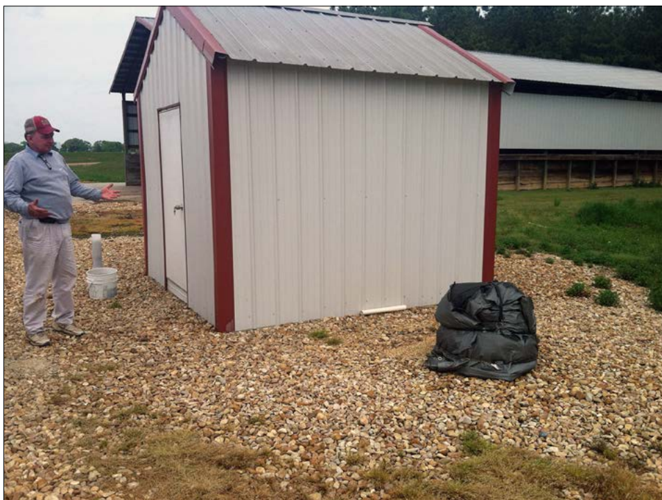
Figure 1. Many producers build some form of house over the well casing to protect it from the environment and other dangers.

Contamination by surface water may occur if the top of the well casing is compromised and/or open. The top of the well casing should be at least 1 foot above the ground. The ground around the well casing should slope down and away to ensure proper drainage. Always keep hazardous chemicals, such as paint, fertilizer, pesticides, and petroleum products, away from the well. Build the generator shed and diesel storage tank away from the well site to prevent the risk of a fuel spill from reaching the well shaft and contaminating the aquifer. Many