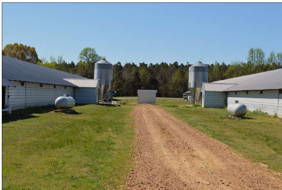
Figure 2. Many producers choose to drill wells between poultry houses.

Producers often disagree with the well driller on exactly where the well should be located. However, in most cases, the well driller is right. Well drillers understand what works best when it comes to a location site and drilling a well. They understand the local area—both the aboveground topography and the aquifers that lie beneath. They have drilled wells for poultry farms before. In most cases, they will know how deep the well will need to be to find an adequate water supply and what kind of volume can be expected from a particular aquifer. If you and the