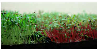
Cilantro and Ruby Red Swiss chard microgreens grow in small black plastic nursery containers. (Gary R. Bachman)