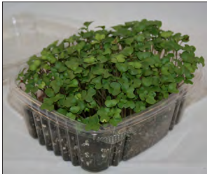
Broccoli microgreens are grown in a repurposed clear plastic clam shell container. (Gary R. Bachman)