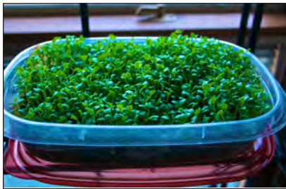
Microgreens are easy to grow in virtually any container like this plastic kitchen storage container. (Cindy Graf)