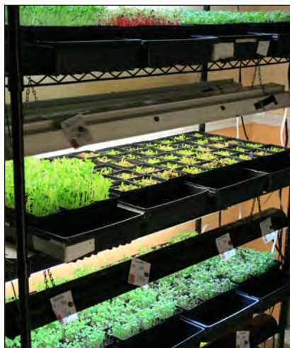
A wide variety of microgreens can be grown indoors under fluorescent lighting. (Gary R. Bachman)

Freshly harvested Swiss chard, broccoli, pac choi, and mustard microgreens make a colorful mix. (Gary R. Bachman)