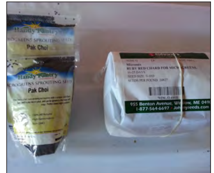
Microgreens should be purchased in bulk from established seed sources.