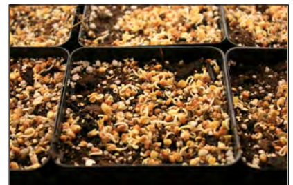
These primed radish seeds display the emergence of the radicle prior to sowing. (Gary R. Bachman)