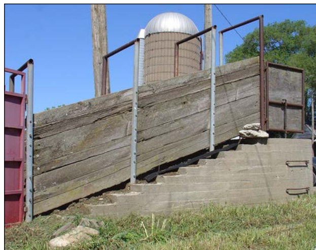
Figure 13. Permanently fixed loading ramps.