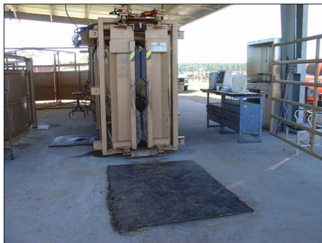
Figure 10. Nonslip mat at chute exit.

Loading and unloading ramps are used to move cattle from ground-based handling facilities to trailers for transportation and vice versa. They can be permanent or portable. Ramp heights may need to differ depending on the type of trailers used. Maintaining loading ramps of different heights or an adjustable-height loading ramp can facilitate a variety of transportation options. If tractor-trailers are to be unloaded, these ramps should be single file (30 inches for mature cattle) to accommodate the 30-inch-wide rear doors standard on most US tractor-trailers. Ramps can be