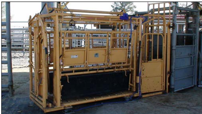
Figure 16. Scales mounted under squeeze chute.