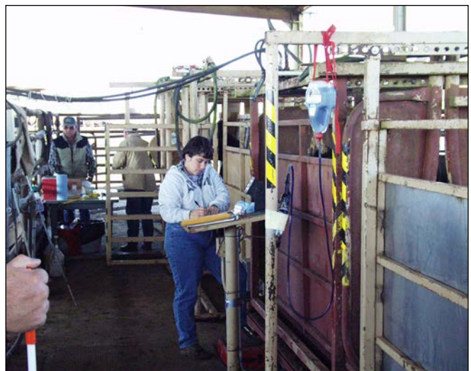
Figure 17. Separate scales compartment before squeeze chute entrance.