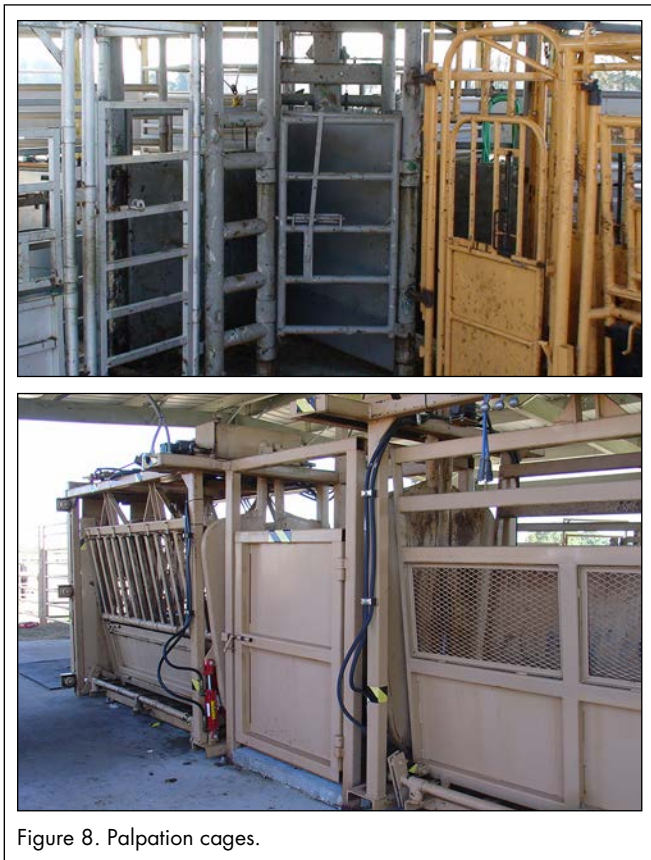
Figure 8. Palpation cages.

The number of cattle that will comfortably fit in a pen is based on the width and length of the pen and the size of the cattle. In general, cattle need 14 to 20 square feet of space each (see Table 1 ). Pen areas should be roughly tripled when holding animals for extended periods, such as overnight. Table 2 presents example holding pen dimensions to provide 20 square feet of space per animal.