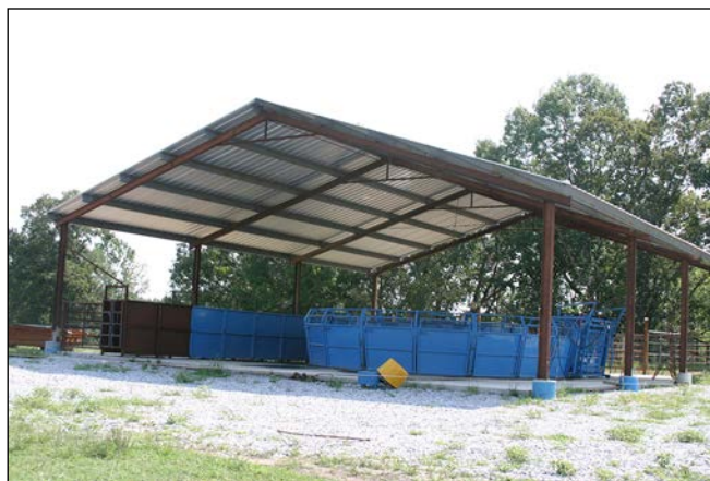
Figure 18. Covered cattle handling facilities.

Safety of the animals and handlers is the primary consideration in developing handling facilities. No matter how efficiently a facility functions, it is unacceptable if design flaws lead to injuries in handlers or animals. Design facilities to avoid protrusions or sharp edges that might cause abrasions or lacerations. Make sure gaps and openings in facility features do not lend themselves to body parts becoming trapped, which could lead to broken bones or choking. Also ensure that safety escapes for handlers are strategically located throughout the facilities.