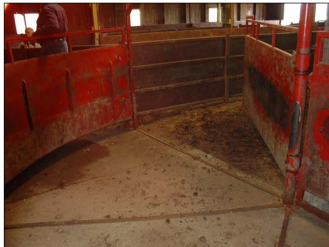
Figure 1. Crowding pen.

There are several important issues to consider when developing new, or renovating existing, animal handling facilities. The most important consideration is the intended uses or objectives. Consider whether the facility will be used to handle 30 cows and calves just a few times per year or to process truckloads of stockers each week. Efficiency refers to the number of animals that can be worked over a given amount of time and should be balanced with cost and safety. Very basic, well-designed and maintained handling facilities are usually sufficient for the average cow-calf production unit in Mississippi and are often the most cost-effective.