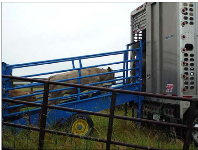
Figure 12. Portable loading ramp.

narrowed to less than 30 inches when only calves will be handled. To avoid cattle striking the sides of the trailer during loading, ramps should not be wider than the trailer opening. Self-aligning dock bumpers and telescoping ramp panels are useful for blocking gaps from misaligned trucks. Injuries can occur if unloading ramps are too steep. Target a loading ramp height of 20 degrees for permanent ramps and 25 degrees for adjustable ramps. Grooved stair steps are recommended for concrete ramps. Design steps to be 4 inches high and 12 inches deep. Table 3 outlines recommended loading chute dimensions.