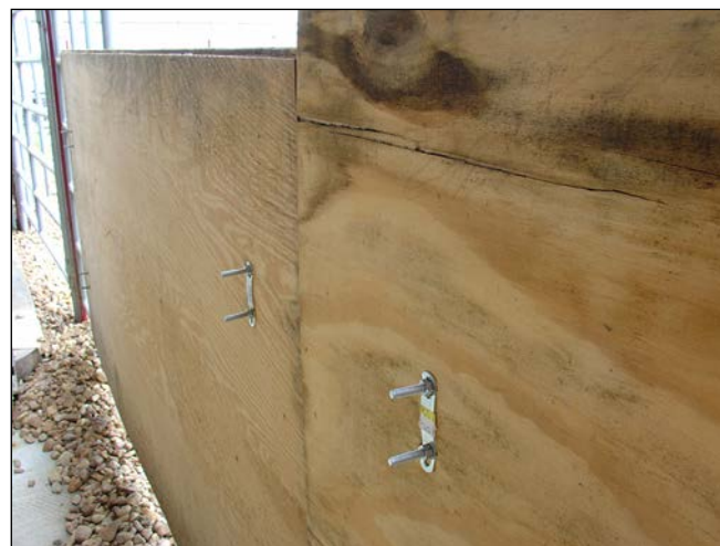
Figure 20. Protruding screws inside cattle handling paths could cause injury.