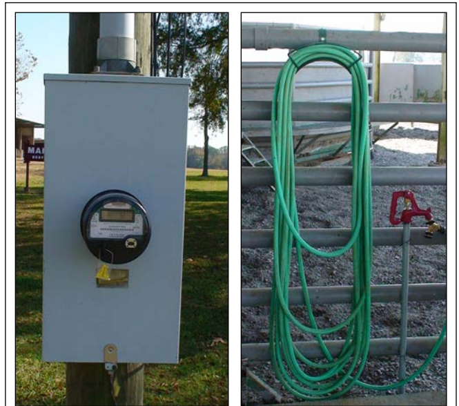
Figure 15. Electric and water utilities.