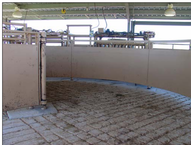
Figure 11. Textured concrete flooring in crowding pen area.