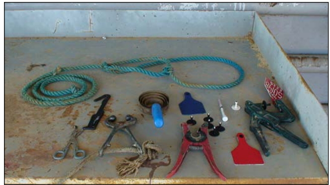
Figure 14. Supplies laid out on a working table close to the squeeze chute.

Capturing cattle weight is important for herd performance programs, genetic improvement efforts, nutritional management, and animal health product dosing. Integrating scales into the alley improves efficiency by letting a handler record cattle weights while other handlers are performing management practices in the squeeze chute. This can be accomplished by using permanent scales behind the chute, load bars under the chute, or portable weigh pans placed in the alley floor.