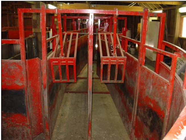
Figure 5. Double-loading alley.