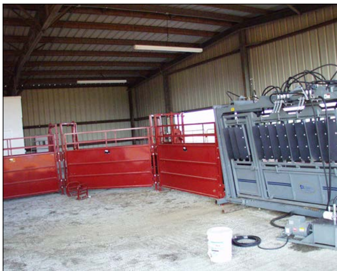
Figure 2. Curved, solid-sided alley.

After the crowding tub, cattle enter an alley or chute, which leads to a chute section where individual animals are restrained. A curved alley maintains flow because cattle see only the animal directly in front of them and naturally follow. Having solid sides on alleys ensures that movement outside of the alley does not cause cattle to balk or slow their forward movement.