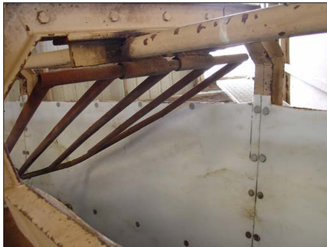
Figure 3. Backstop in alley.

go under them but then fall back down below hip level after cattle move past. They are typically adjustable to facilitate handling cattle of various heights. If backstops are used, place them in strategic locations within the alley to make handling more efficient. Improperly used, backstops may contribute to unnecessary bruising of the backs and rumps of cattle.