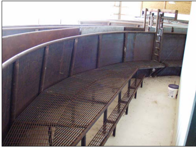
Figure 4. Catwalks along outside of alleys.