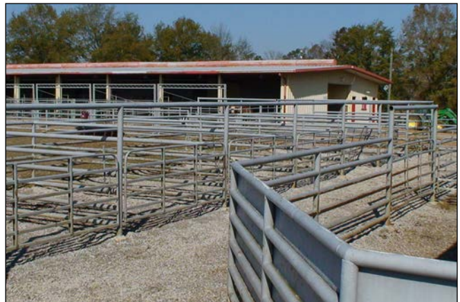
Figure 9. Sorting pens.

Set up pens off of a lane leaving the chute so that the cattle can be sorted immediately after processing. Make sure the gates hinge on the proper side so they will swing in the desired direction to move cattle directly into pens. The number and sizes of sorting pens needed depends on the number and sizes of cattle to be handled. Larger operations may need more sorting pens than smaller operations.