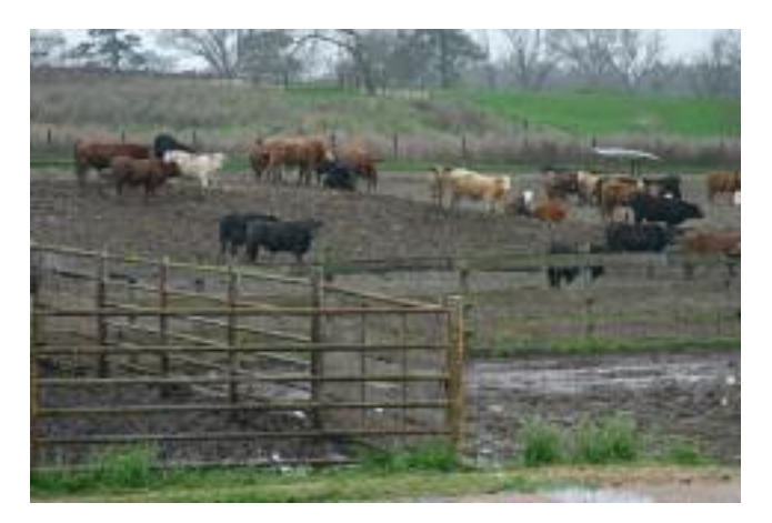
Sturdy fences are essential for receiving cattle.

Border holding pens with sturdy fences. Wood or metal pipe are good materials for building receiving area fences. Fences should be at least 50 inches tall with posts set deep enough into the ground to withstand cattle's crowding into the fence without the posts or fence moving.