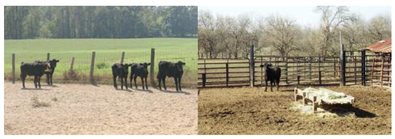
Calves isolated in hospital pens.