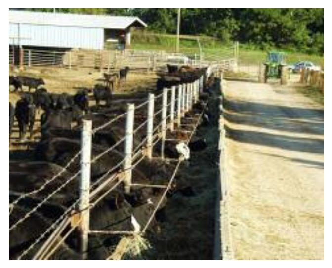
Calves with access to a palatable receiving diet with hay included.

Although cottonseed hulls are relatively low in nutrient value compared to other feedstuffs, they can serve as a good fiber source or "scratch" factor to stimulate gut movement and reduce the risk of acidosis. Cottonseed hulls are generally very palatable to cattle and can work as an appetite stimulant as well. Pelleting ingredients, such as soybean meal, minerals, and other additives, can promote intake as long as the pellets are not too hard or large (diameter of pellet should be ½ inch or less). Pelleting roughages reduce the "scratch" factor, so any pelleted diet needs to include at least two to three pounds of longstemmed hay per day.