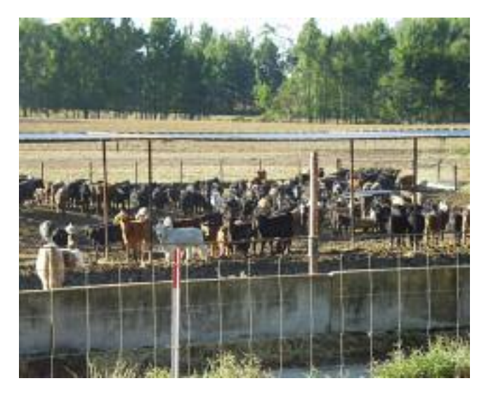
Calves housed in a receiving pen with shade access.

of feed troughs and water tanks in receiving areas is discussed in the nutritional management section later in this publication.