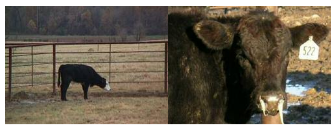
Calves exhibiting signs of illness.

Young, growing calves are one of the most challenging classes of cattle for which to plan nutritional and health programs. Planning for stressed calves is even more critical. Emphasize effectively planning stocker cattle facilities, nutrition, and health programs before calf arrival. For more information on stocker cattle receiving programs, contact an office of the Mississippi State University Extension Service.