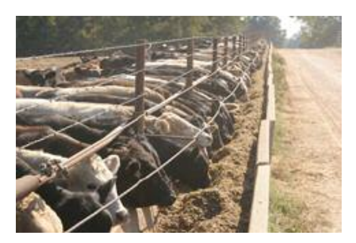
Placement of feed bunks along a fence line.

Good management can help newly arrived calves get on feed as quickly as possible. Calves initially walk the boundaries of their new pens searching for a way to escape. Placing feed bunks and water troughs along the fence lines of receiving pens, as opposed to in the center of the pens, increases the frequency of calves' walking past the bunks and troughs. Therefore, calves find water and hay easier if they are placed around the fences. Using trainer or lead cattle to show newly arrived calves the locations of feed and water can also be effective.