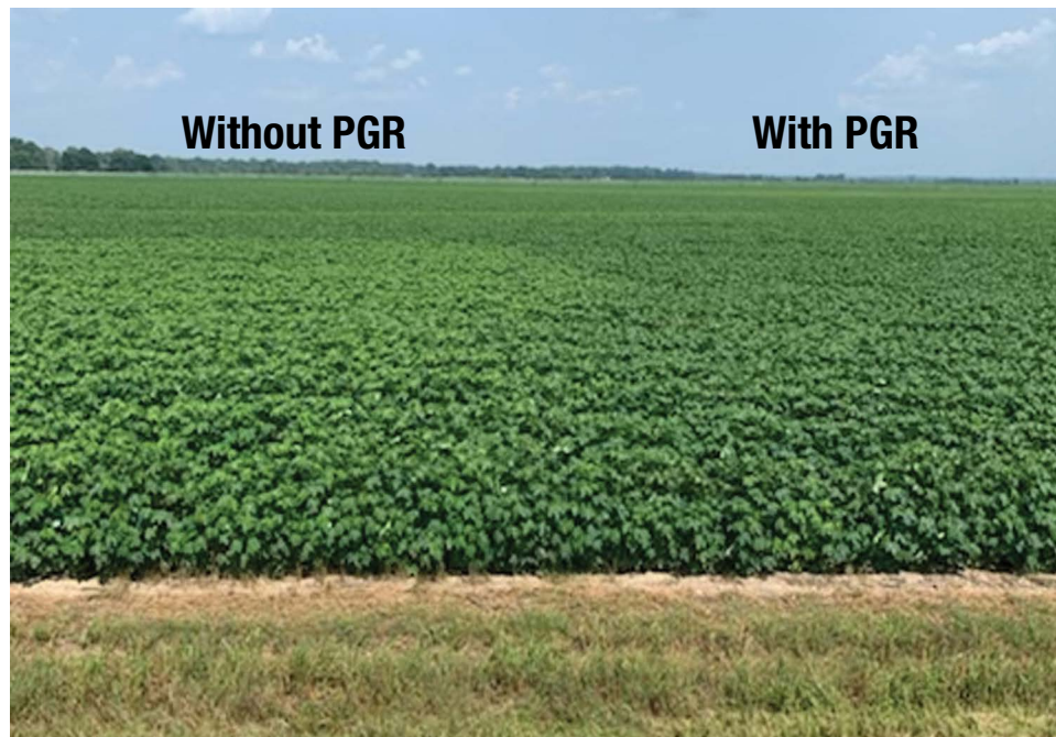
Figure 1. Cotton plant height reductions associated with PGR application.

As cotton enters the reproductive growth stages, a solid PGR strategy will limit plant height, improve air circulation through the canopy, increase defoliation efficiency, and enhance harvest efficiency.