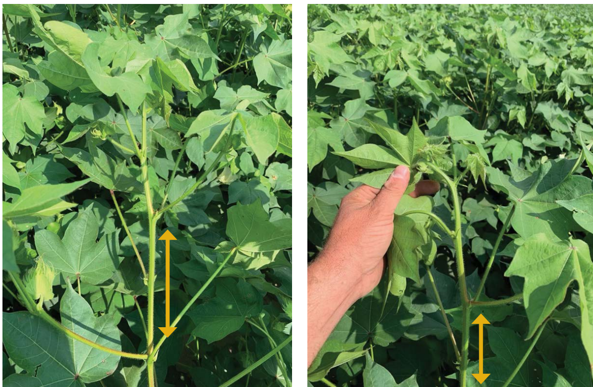
Figure 3. Internode distances greater than 3 inches in cotton without a PGR application.