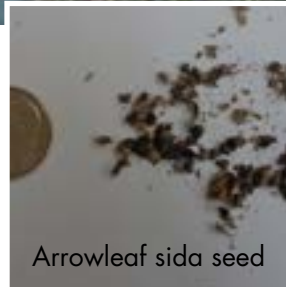
Arrowleaf sida seed