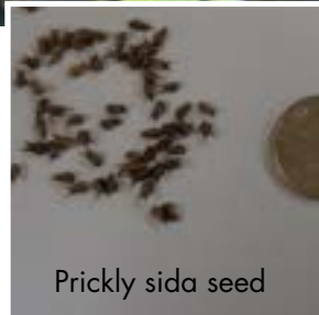
Prickly sida seed