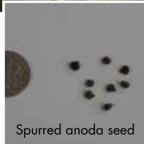
Spurred anoda seed