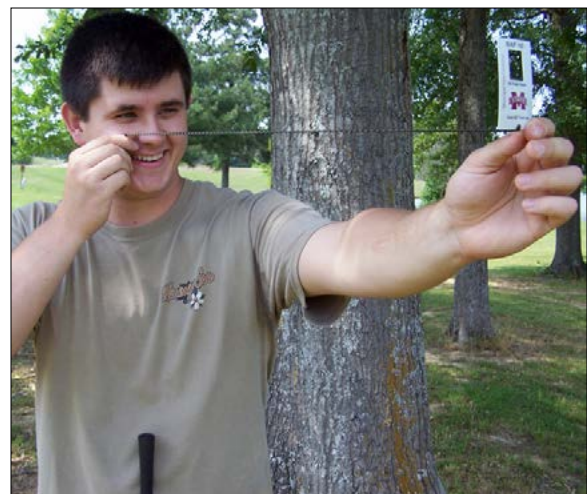
Figure 1. Using the MSU Basal Area Angle Gauge at 25 inches from eye.