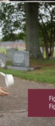
Figure 4. Aedes mosquitoes may breed in used tires.