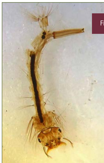
Figure 6. Mosquito larva.

Anopheles larvae lie parallel to the water surface, supported by small, notched organs on the thorax and clusters of float hairs along the abdomen.