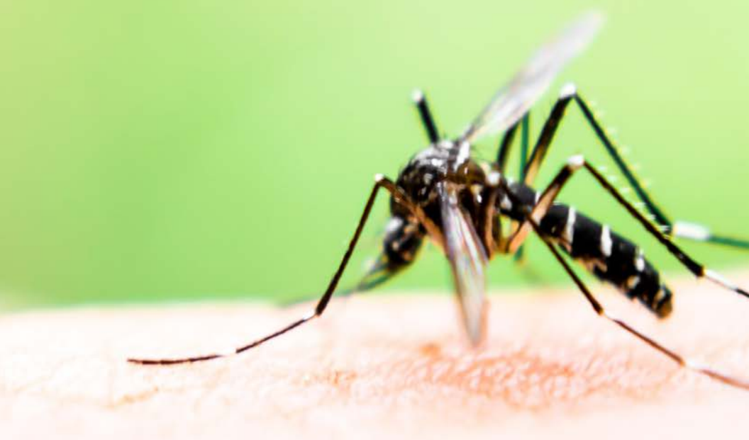
Figure 1. Numerous mosquito bites on a person's hand.

With the elimination of many deadly mosquito-borne diseases from the United States, our control efforts are now mainly aimed at pest mosquitoes rather than disease vectors. However, increasing travel by U.S. citizens into countries where dengue fever and malaria are prevalent and people from those countries immigrating into the United States increase the likelihood of these diseases being reintroduced. Mosquito control continues to be an important program in public health because of the presence of WNV and SLE, as well as the potential for the reintroduction of other mosquito-borne diseases into Mississippi.