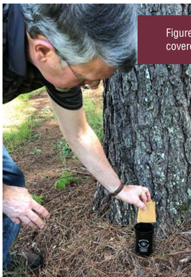
Figure 8. Fit the oviposition cup with felt-covered paper or other stiff paper.