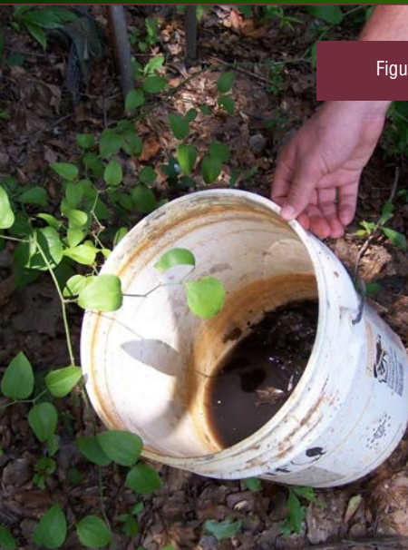
Figure 3. Mosquitoes can breed in containers like this old bucket.

aware of the behavior and biology of the local mosquitoes. They will be encountering the mosquitoes firsthand, visiting their breeding sites, observing their numbers and developmental stages, and gauging the response of the larvae to the larvicide used.