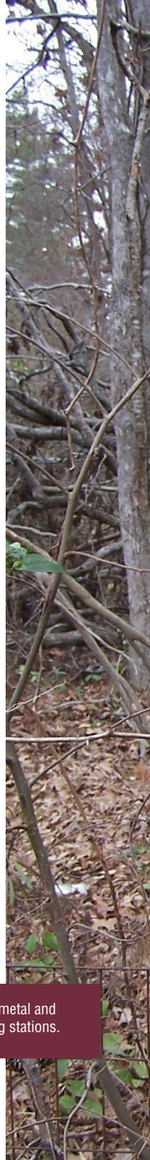
Figure 11. New Jersey light traps are metal and usually located at permanent sampling stations.

The New Jersey light trap is a larger metal device, usually located at a permanent sampling station ( Figure 11 ). This trap is often equipped with a timing device that turns it on during selected hours on certain days of the week. It works on the same general principal as the CDC light trap, except that it uses 110 AC power, and mosquitoes are sucked into a paper cup inside a jar containing a killing agent such as a piece of Vapona pest strip. The paper cup