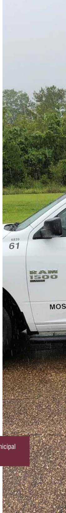
Figure 18. A City of Vicksburg municipal mosquito control truck.

A larvicide program uses biological methods to control pests without