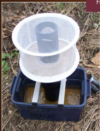
Figure 12. Gravid traps use water as a mosquito attractant.

prevents mosquitoes from coming into direct contact with the pest strip. Generally, New Jersey traps require little maintenance. This trap will attract many different types of insects along with mosquitoes. If no insects are caught in the trap, it could be due to loss of power, a timer that needs to be reset, pest strips that have lost effectiveness, or a non-working light bulb, or the trap may need to be cleaned. The inside cone can be cleaned with a bottle brush. At least once per year, clean the entire trap with a degreasing agent to maintain efficacy.