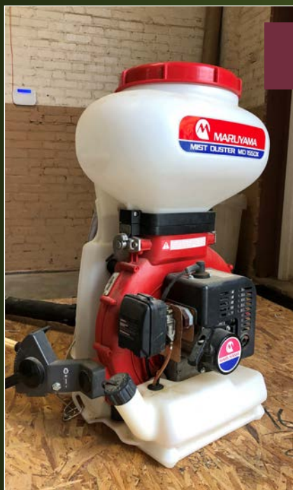
Figure 7. A backpack mister/blower can apply either a spray mist or granules.

Some types of artificial containers cannot be disposed of or removed because they serve some useful purpose. In these situations, mosquito breeding must be controlled by applying Bti or other suitable larvicides or by preventing adult mosquitoes from entering these containers and laying their eggs. For example, cisterns used to collect rainwater should have well-screened tops. Small-animal watering pans should be emptied and cleaned at least weekly. Livestock watering troughs should also be drained weekly if mosquito breeding is found or larvicided with methoprene products. Bti can be applied to many types of artificial containers that are