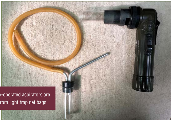
Figure 13. Manual and battery-operated aspirators are used to remove mosquitoes from light trap net bags.

To deliver mosquitoes to an entomologist, place the collection boxes in a larger, sturdy container and fill loose spaces around the collection boxes with paper or packing peanuts. Secure the lid carefully and mark the container “fragile.” As an extra precaution, place a wisp of cotton on top of the upper tissue layer of each collection box. This will help keep the mosquitoes from being shaken around inside the collection boxes. These steps may seem a little extreme, but the identifying entomologist needs good-quality samples for accurate identification. This is especially important when initially collecting adults from an area and compiling a reference collection and species list.