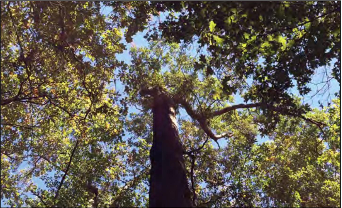
Figure 2. These oaks are growing in green tree reservoir. Note the crown dieback due to root damage resulting from repeated annual flooding.