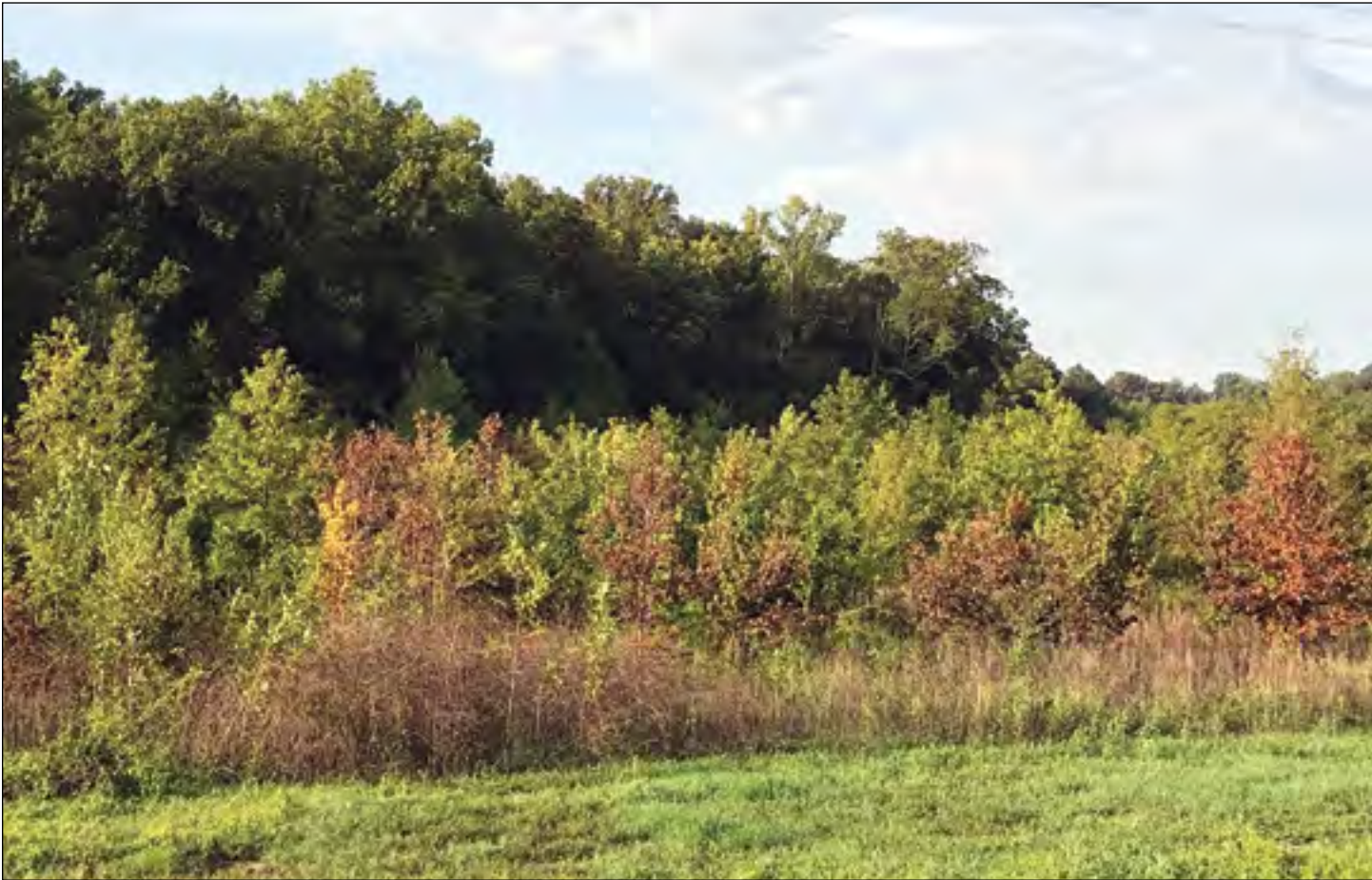
Figure 3. Long-duration flood damage can be seen in the form of chlorotic and necrotic leaves in these sapling-sized Nuttall and water oaks. However, these trees recovered, and overall stand mortality was low.

Tree age and health also have serious implications regarding the level of flooding damage sustained. Typically, trees in the sapling to mature age range are the least