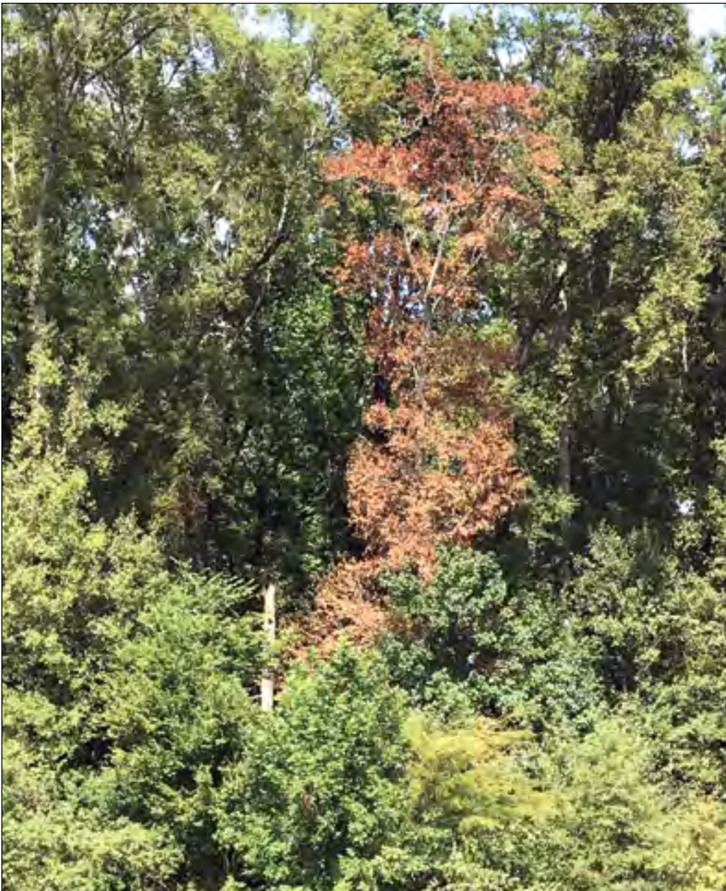
Figure 4. A suppressed water oak is not able to contend with flood waters.

susceptible to damage from flooding (as long as the species is appropriate for the site) (Table 2). While these trees do experience some level of root and/or crown damage, they often are able to overcome this setback, and mortality is relatively limited. Conversely, mortality of freshly planted seedlings and over-mature trees is usually higher.