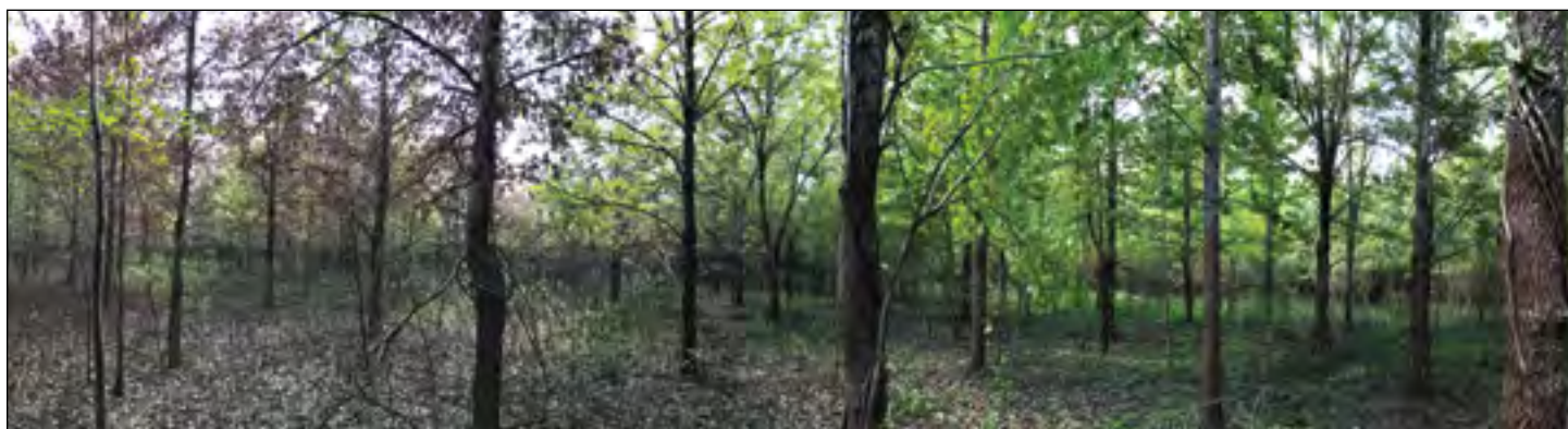
Figure 6. This is an example of Shumard and Nuttall oak planted on Mahannah Wildlife Management Area near Redwood, Mississippi. Shumard oak (left side) is not adapted to wet, heavy clay soils, and 100 percent mortality occurred during the 2019 flood.

Flooding damage to trees is typically the result of injury to root systems. Often, this damage escapes immediate observation and accumulates gradually over time. Physical signs like crown dieback are obvious indicators. It is often impossible to provide a complete long-term prognosis of flood damage using only observable physical indicators. In many cases, root damage will continue to influence overall decline in tree health. This decline may not become apparent for several years. More immediate symptoms (often only manifesting in major flooding events) may occur the form of leaf chlorosis (yellowing), smaller-than-normal leaves, a complete lack of foliage, death of small branches/twigs, and epicormic sprouting (dormant buds that emerge as branches in stressful events).