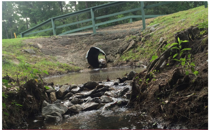
Figure 8. This low-grade weir or check dam on a golf course in south Mississippi improves water quality by increasing hydraulic residence time of flowing water, allowing additional time for sediment to settle out of the water column and pollutant removal by natural processes.

Section 401 of the CWA requires that any person applying for a federal permit or license, which may result in a discharge of pollutants into WOTUS, must obtain a state water-quality certification that the activity complies with all applicable water quality standards, limitations, and restrictions. No license or permit may be issued by a federal agency until certification required by section 401 has been granted. Further, no license or permit may be issued if certification has been denied. Including this 401 certification step allows states and tribes to take a more active role in decisions impacting aquatic resources for better consideration of local concerns in the federal permitting process. In most cases, Section 401 certification review is conducted at the same time as the federal agency review for a Section 404 permit. More information about Section 401 permitting can be found at https://www.epa.gov/cwa-404/clean-water-act-section-401-certification .