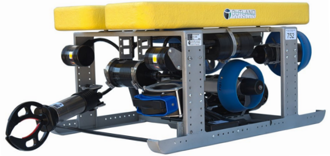
The Outland Technology ROV-2500, which is being used to record video footage for relative abundance indices.