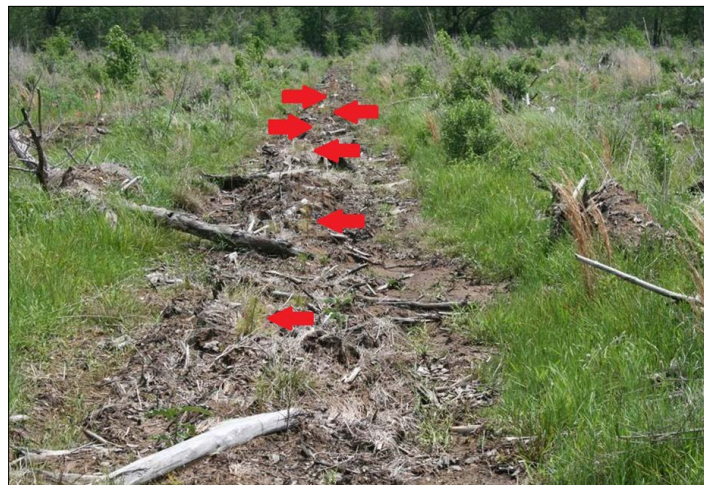
Figure 3. Effective herbaceous weed control. Note the undamaged and free-to-grow pine seedlings.

Site preparation will not typically provide long-lasting control of herbaceous competition after planting unless a product with sufficient residual soil activity is added to the mixture. HWC involves using herbicides designed to control herbaceous competition during the first growing season after planting (Figure 3). Often, the herbicide is simply included in the site preparation tank mix and is one of these two products: