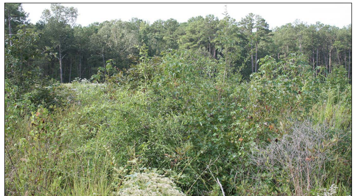
Figure 1. Typical scenario encountered in cutovers. Note presence of both woody and herbaceous competition.

Applications using imazapyr (e.g., Arsenal® AC, Chopper® Gen2) and glyphosate (e.g., Accord® Concentrate, Accord® XRT II) are typically prescribed for use in pine management. Planting should not be