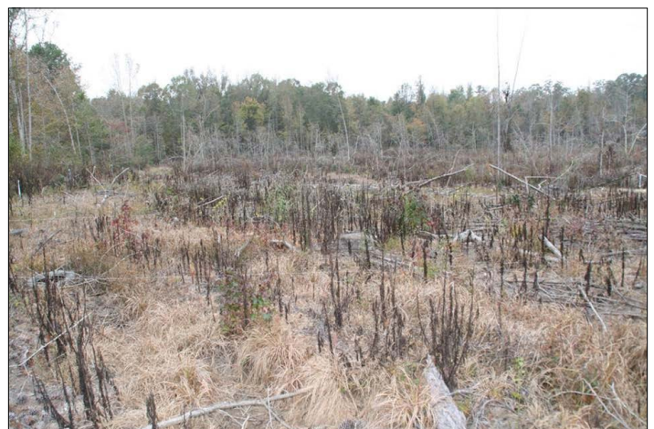
Figure 2. Excellent vegetative control post-chemical site preparation.