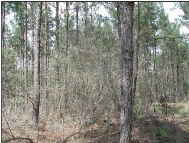
Figure 5. Example of mid-rotation brush control application results.

This application type is similar to woody release; however, the practice is performed later in a stand's rotation (Figure 5). Typically, treatment occurs the first year after a thinning operation when pines are 15- to 18-years-old. However, if delayed, the application should be performed