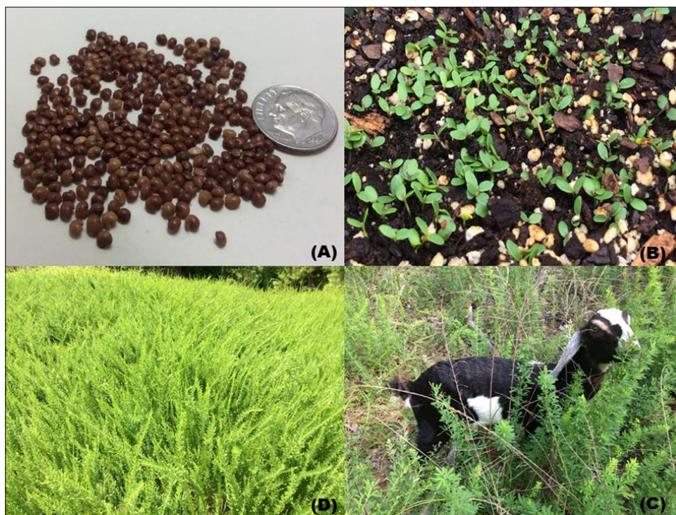
Figure 1. Seed size (A), seedling emergence (B), grazing utilization (C), and biomass production (D) of sericea lespedeza.

Lespedeza is usually established as a pure stand or as a companion legume with cool- and warm-season perennial grasses. The seeding rate varies with the type of lespedeza being used (Table 1). When seeding into a warm-season perennial pasture, broadcast or drill seed in late summer or early spring. Adjust seeding rates accordingly if germination is less than 85 percent. If the seed is not pre-inoculated, inoculate the seed with the recommended rhizobia strand ( Bradyrhizobium spp., EL type inoculant).