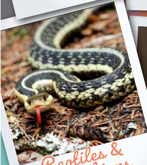
Reptiles & Amphibians