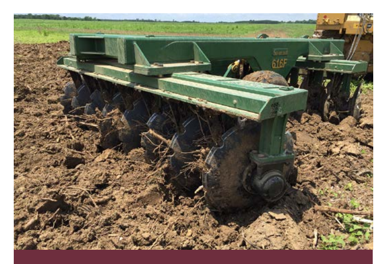
Figure 8. Site preparation disking before planting trees.

Conventional subsoiling is performed by pulling a 3- to 6-inch-wide shank through the soil behind a tractor. Typical cutting depths are between 16 and 24 inches using straight or parabolic shanks with or without winged tips. A problem associated with traditional subsoiling is the time needed for the trench (also known as a slit) to close properly. Sometimes as much as a year and several rain events are needed for proper closure of large trenches created by wide shanks. Soil drying during the growing season can cause open cracks resulting in seedling mortality when root systems are exposed to the drying effects of air in these opened trenches. In addition, large soil clods (especially in heavy clay soils) often form along the subsoil trench when using parabolic shanks. These may impede tree planting. Both of these soil