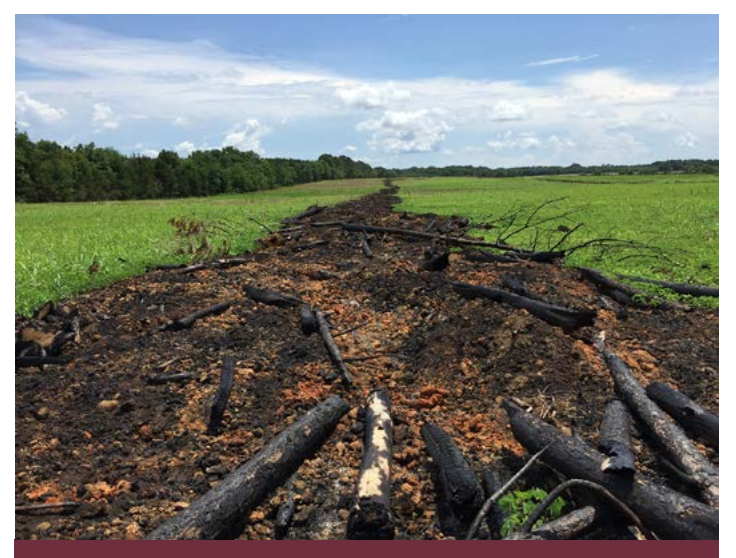
Figure 5. This windrowed site is ready for replanting after being burned. Note the amount of topsoil in the windrow.

One negative effect of site preparation treatments such as shearing and chopping is the possibility of increasing undesirable woody species. This is less of a problem in areas being disked regularly, and of minimal concern on former agricultural areas. Disking typically involves pulling a double-gang disk across the site to be regenerated. The soil is mixed and loosened, and competing plant roots are severed. Disking is sometimes recommended for site preparation of retired fields to encourage establishment of light-seeded tree species. However, research has shown as many as twice the number of stems of light-seeded tree species (e.g., sweetgum, elm, sugarberry, cottonwood, sycamore, ash) in undisked areas compared to disked