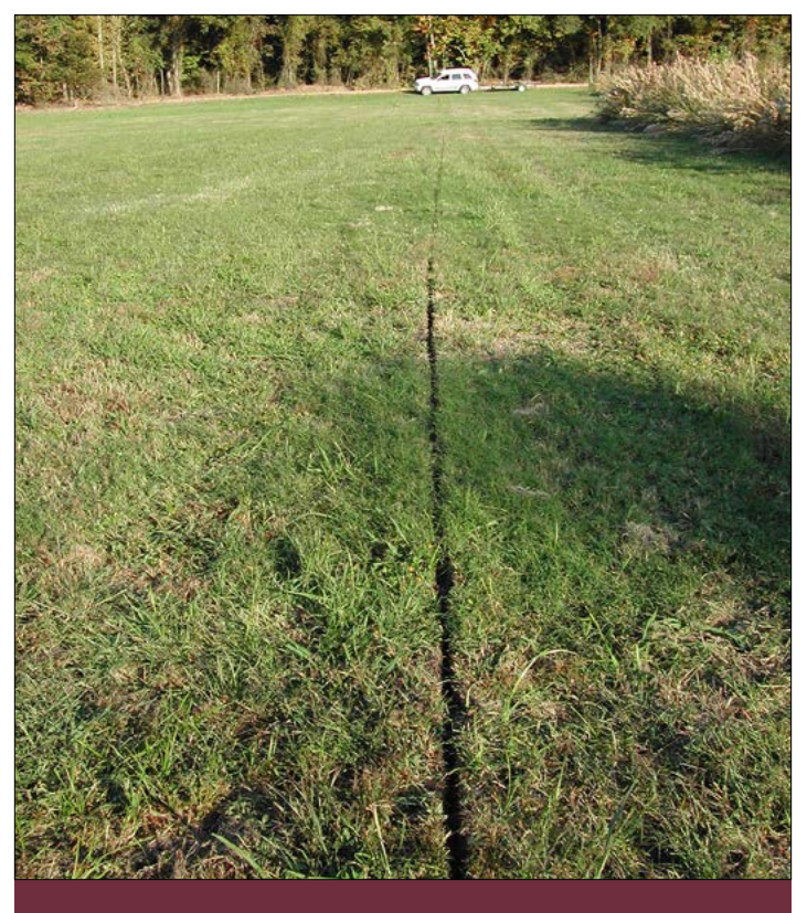
Figure 11. Subsoil trench cut using a no-till subsoil system.