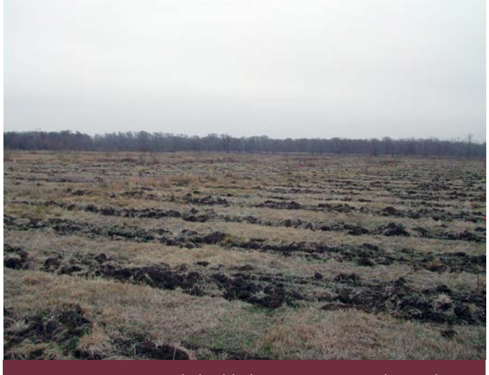
Figure 16. Site recently bedded in an attempt to elevate the rooting zones for seedlings to be planted.