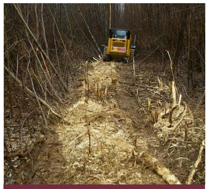
Figure 2. Example of mulching older, undesirable hardwoods. Note the presence of stumps and the potential for future stump sprouting.