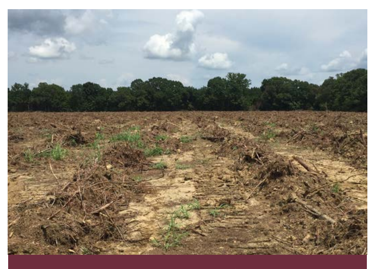
Figure 4. This windrowed site is ready for replanting.

The primary benefit of mowing as a mechanical treatment is improved planting conditions. Planting seedlings is more efficient, and proper plant spacing is more easily obtained for a short period of time after mowing. This can result in lower planting costs in some situations. While mowing is not typically used for site preparation in forest management, vendors should be easy to find. Per-acre costs should average somewhere between $35 for retired fields or pastures to $60 in areas with numerous small, woody stems.