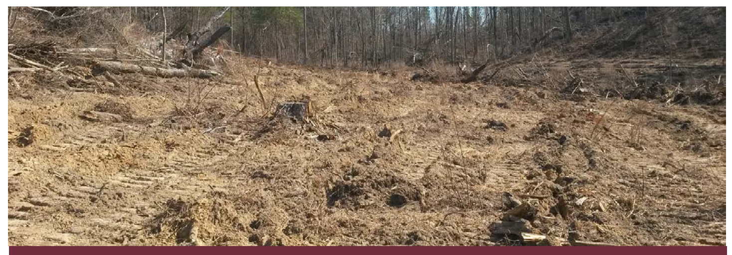
Figure 13. Subsoiling along topographic contours in a recently clearcut area.