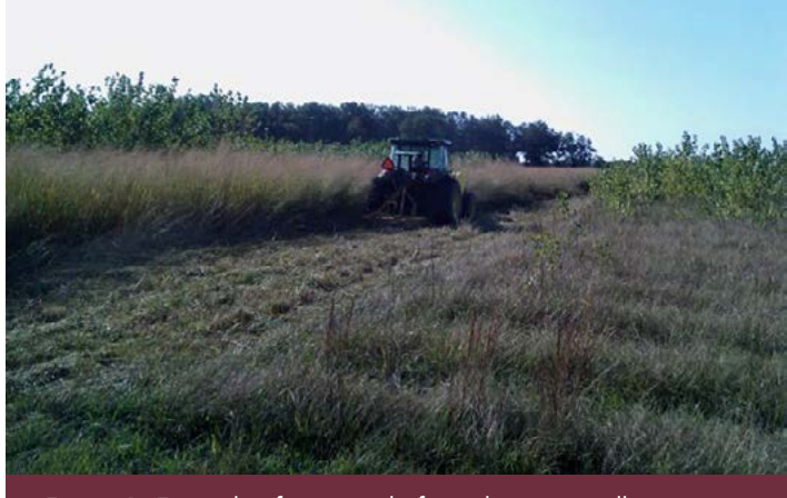
Figure 1. Example of mowing before planting seedlings.

In forested soils, organic matter accumulates as the litter layer on top of mineral soil in the form of fallen