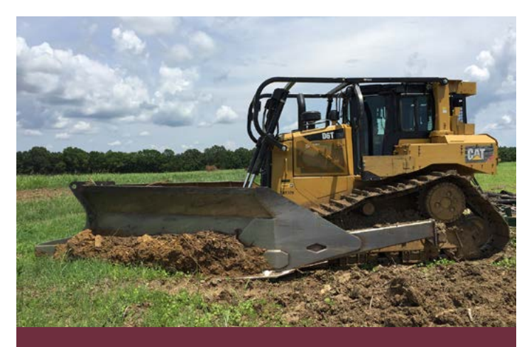
Figure 3. A V-blade attached to a bulldozer.