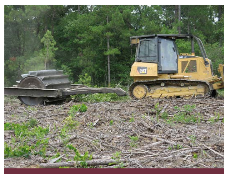
Figure 6. A drum chopper being pulled by a bulldozer.