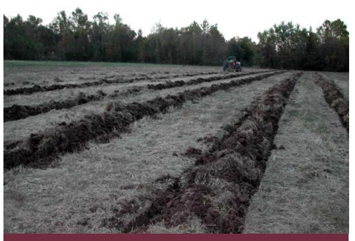
Figure 17. A combination-plowed area ready for planting seedlings.