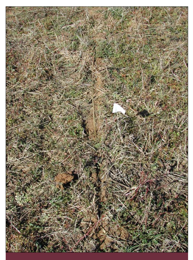
Figure 12. Subsoil trench cut using a no-till subsoil system.

conditions can cause substantial problems.