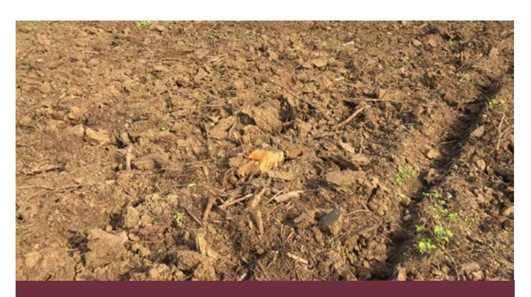
Figure 9. Proper disking for site preparation should use disk systems capable of breaking up woody root systems and debris. Note broken stumps inside disking treatment.