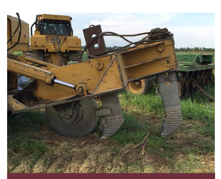
Figures 14 and 15. Offset double-shank subsoil system often used in cutovers. Note heavy-duty construction for increased shear-stress on tracts with increased roots and stumps.

Mechanical site preparation can be useful for regeneration efforts. However, performing effective mechanical site preparation can be cost-prohibitive in some cases. Choose site preparation methods on a case-bycase basis, and consult with a forestry professional when selecting appropriate forestry management techniques. Give careful consideration to site-specific soil conditions, techniques that might be used to correct problems, and the budget available to perform mechanical site preparation.