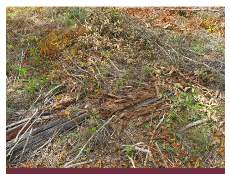
Figure 7. Drum-chopped vegetation. Note the resprout potential of severed woody stems.