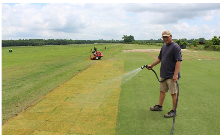
Figure 3. Hand watering is the best means of ensuring the success of newly laid sod. Water until soil becomes soft.

During warmer or drier months, there is no rule of thumb for how much water to apply. Sod should never turn bluish-gray, which indicates it is not moist enough. But water should also not be running into the surrounding streets. A sprinkler is only adequate when it is moved often to ensure complete coverage. Hand watering while checking for moist soil beneath the sod is the best technique.