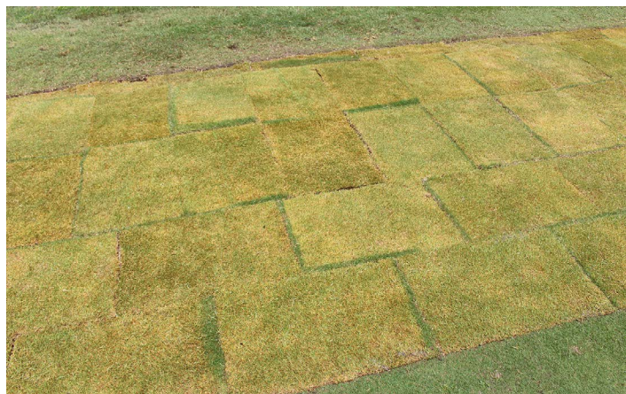
Figure 2. Correctly staggered sod seams. Notice that this sod has been on a pallet for several days but will still recover if adequate moisture is applied immediately after laying.

When laying squares or rolls, it is important to stagger ends ( Figure 2 ). Erosion potential is greatest in straight lines, so it is especially important to avoid creating straight channels oriented down a slope. It is best to orient the first row of sod being installed along a straight edge, such as a street, or parallel to the front of the home. Save trimming and edging for last. Use a straight edged shovel or machete.