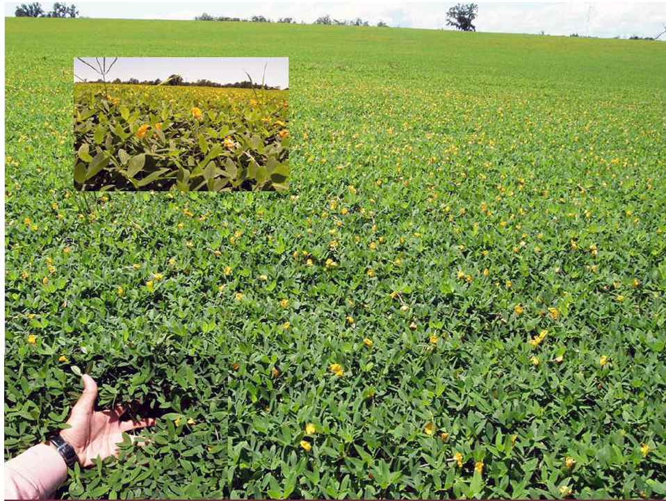
Figure 2. Established field of perennial peanuts in the Florida Panhandle.

Average daily gains of 1.7 pounds on steers grazing perennial peanuts have been reported, compared to 1.0-pound daily gains on bahiagrass. In grazing dairies with minimal supplementation, Holstein cows grazing perennial peanuts produced approximately 10 percent more milk than cows grazing Tifton 85 bermudagrass, which is considered a high-quality warm-season perennial grass.