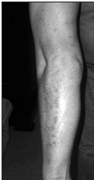
Figure 2. Bed bug bites on arm 5 days post-bite.

Bed bugs have piercing/sucking mouthparts typical of the insect order Hemiptera. The bites are usually not noticed; however, some people do experience allergic reactions to saliva from the bites (much like mosquitoes) and can develop itchy welts, even blisters sometimes (Figure 2). Excess scratching can lead to secondary infection. Bed bug bite reactions usually clear up on their own and require little specific treatment other than antiseptic or antibiotic creams or lotions to prevent infection.