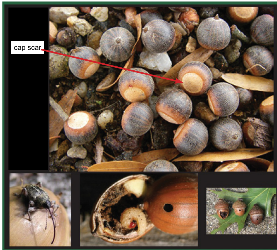
Figure 2. (Top) These water oak acorns show prominent cap scars. Bright white cap scars indicate viable acorns. (Bottom) The most significant acorn pest is the acorn weevil. It bores holes into acorns, and its larvae feed on them. Composite image by Linda W. Garnett.