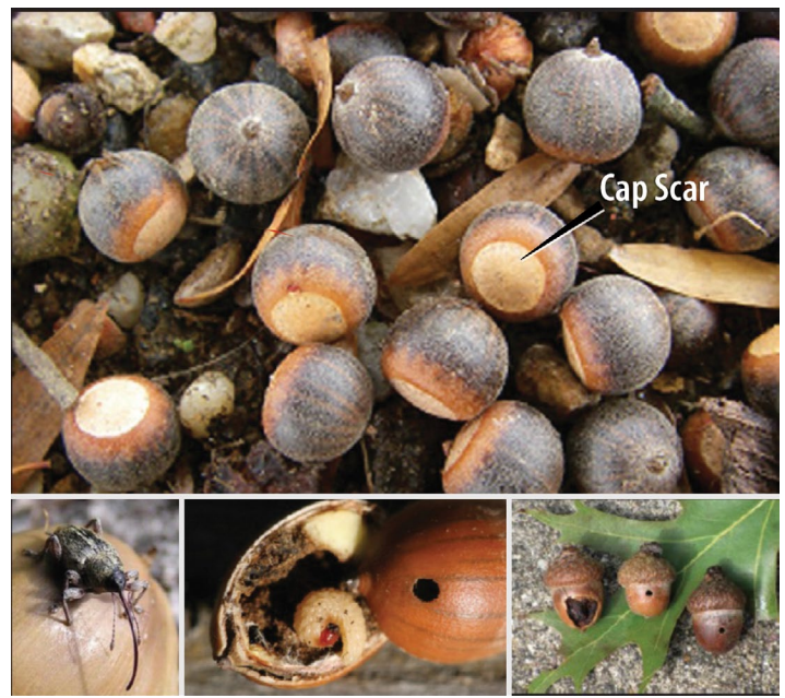
Figure 2. (Top) These water oak acorns show prominent cap scars. Bright white cap scars indicate viable acorns. (Bottom) The most significant acorn pest is the acorn weevil. It bores holes into acorns, and its larvae feed on the acorns.

unsound acorns, and it ensures an adequate supply in the event that germination rates are low.