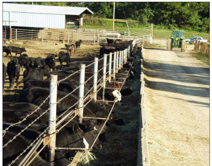
Calves with access to a palatable receiving diet with hay included.

Newly received calves typically have decreased feed and water intake from one day to several days. Upon arrival, calves should be placed in small lots with adequate shade and clean water. Calves over 400 pounds will likely be able to easily recognize and consume hay. They should have access to good-quality grass hay to stimulate proper rumen function. Let the calves shipped from long distances rest upon arrival, and plan to process them the next morning.