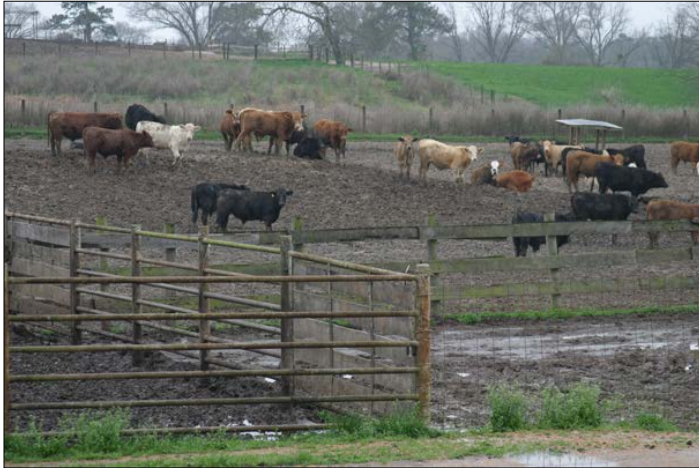
Sturdy fences are essential for receiving cattle.

Border holding pens with sturdy fences. Wood or metal pipe are good materials for building receiving area fences. Fences should be at least 50 inches tall with posts set deep enough into the ground to withstand cattle's crowding into the fence without the posts or fence moving.