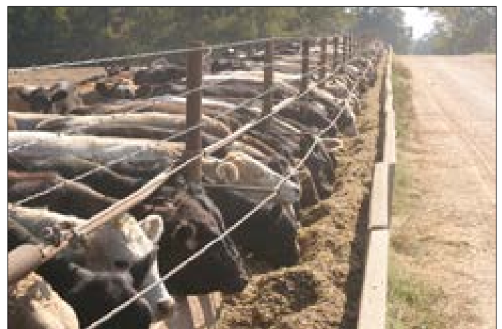
Placement of feed bunks along a fence line.

Good management can help newly arrived calves get on feed as quickly as possible. Calves initially walk the boundaries of their new pens searching for a way to escape. Placing feed bunks and water troughs along the fence lines of receiving pens, as opposed to in the center of the pens, increases the frequency of calves' walking past the bunks and troughs. Therefore, calves find water and hay easier if they are placed around the fences. Using trainer or lead cattle to show newly arrived calves the locations of feed and water can also be effective.