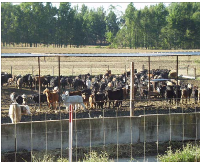
Calves housed in a receiving pen with shade access.

Design and manage receiving pens to house cattle with plenty of space for each animal. Provide at least 14 square feet of pen space per head of calves and 20 square feet of pen space per head of mature cattle. Provide adequate shade in receiving pens, particularly during warm, humid weather. Strategic placement of feed troughs and water tanks in receiving areas is discussed in the nutritional management section later in this publication.