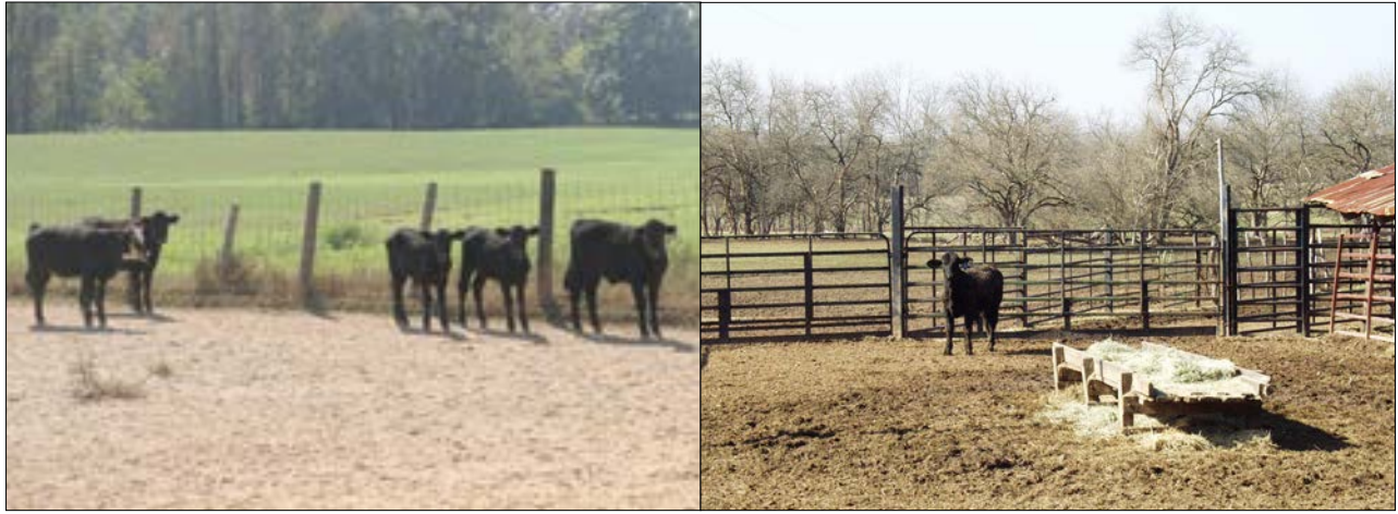
Cattle isolated in hospital pens.