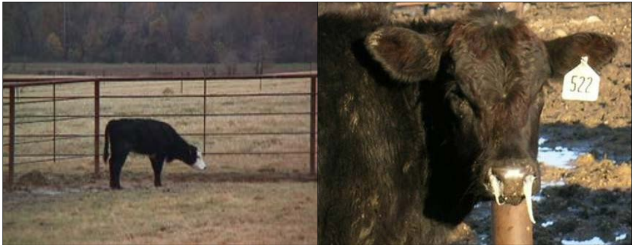
Calves exhibiting signs of illness.

and “pulled.” However, do not go strictly by the calf’s temperature. If calves appear sick (exhibit nasal discharge, labored breathing, or unthrifty appearance) or are not eating, treat them.