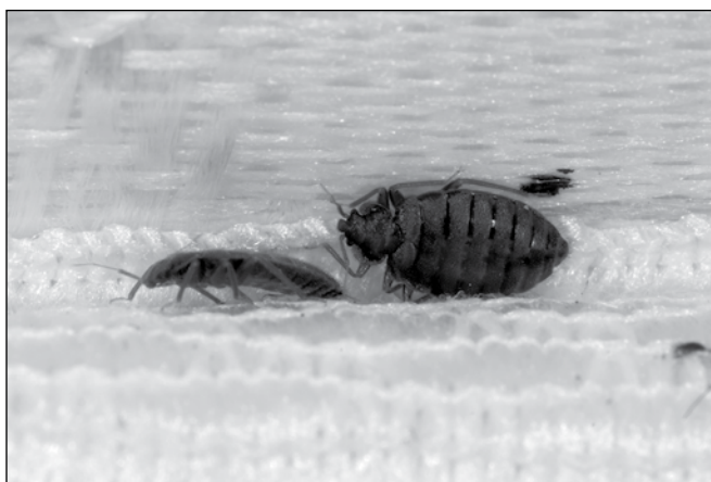
Figure 1. Adult bed bugs on a mattress.