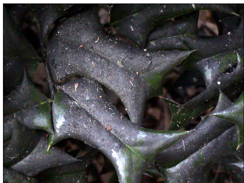
Figure 1. Sooty mold on holly in the early spring. Notice the flaking from the leaf.

Any outdoor structure; many plants but especially gardenias, camellias, laurels, azaleas, and crepe myrtles.