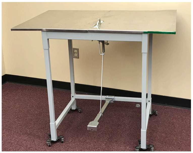
Figure 3. A pedal-operated clamp mechanism attached to a work table is the best practice for commercial producers.

Purchasing the materials to make this design from a wholesale florist would cost around $50. Our study found that consumers are willing to pay much less than that figure, on average around $26. However, this should not be the deciding factor in producing these products. Farmer florists can grow, process, manufacture, and market these wreaths and maintain a profit. This design can be augmented with additional preserved or permanent botanicals (silk flowers) to attract customers, but some clients prefer a rugged, natural look.