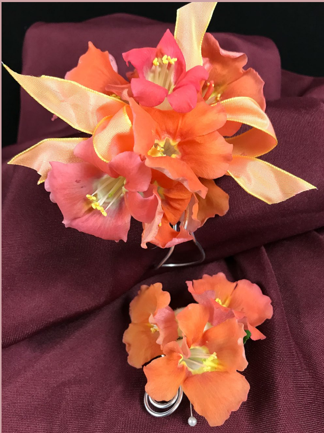
Figure 8. Corsage and boutonniere.

Snapdragons can hold up for several hours if treated with multiple coats of anti-transpirant spray. For a boutonniere, construct the armature from 12-gauge decorative aluminum. Jewelry pliers help to bend the malleable wire into curls