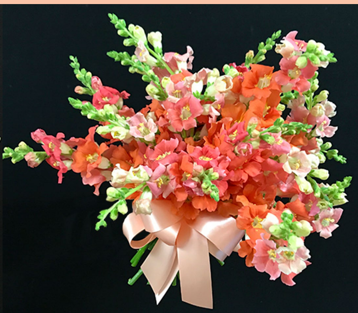
Figure 7. Snapdragon bouquet.