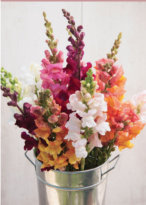
Figure 1. Single-flowered snapdragons, Costa Mix.

length when cut. The diverse flower colors of the snapdragon’s tall spikes allow florists and consumers numerous design options. Most of the snapdragon stems in flower shops are grown in greenhouses under carefully controlled conditions to provide long, straight stems. However, many consumers and florists prefer the more casual look of field-grown stems. They are easy to row and come in a wide variety of colors.