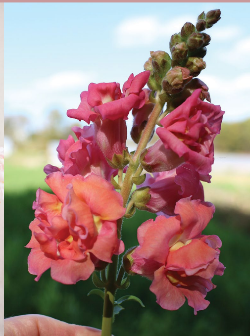
Figure 2. Double-flowered snapdragons, Madame Butterfly.