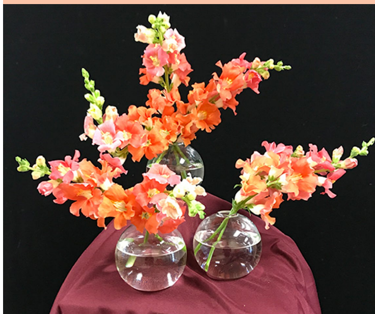
Figure 6. Snapdragon table centerpiece trio.

The informal, hand-tied bouquet in Figure 7 uses paper-covered wire to bind approximately 15 snapdragon stems. The stem placement follows the traditional spiral placement technique, while the overall bouquet is asymmetric. A double-faced, coral, satin bow completes this quick design.