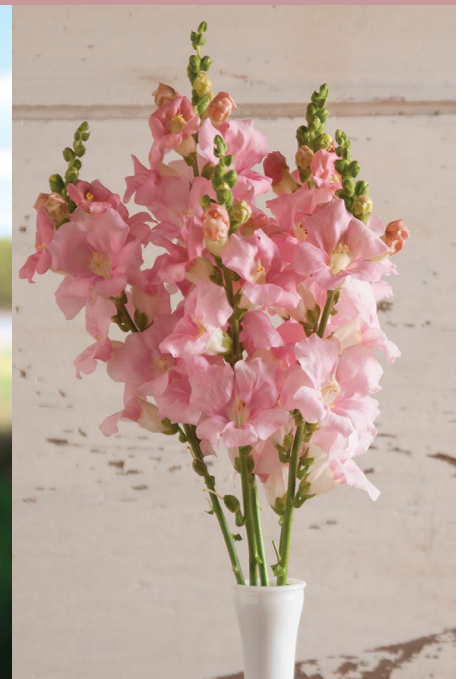
Figure 3. Open-face snapdragons, Chantilly Light Pink.