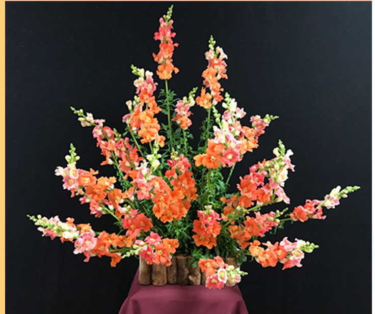
Figure 4. Snapdragon altar arrangement.