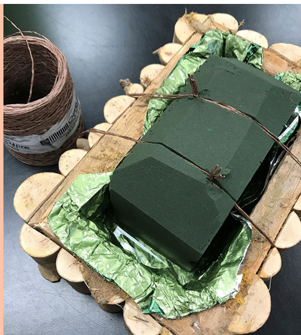
Figure 5. Mechanics.

When planning decorations for guest tables at an event, you may not know table sizes and shapes until you get there. A good technique in such situations is to create several small designs (see Figure 6). When it is time to decorate the tables, small designs can be configured in triangles or squares to decorate round tables. Place them in straight lines or zigzags to adorn rectangular or oval tables. The snapdragons in Figure 6 were arranged using two to three stems per vase, with each stem falling on a diagonal. The geometry of the overall design is not so much about arranging the vases, but keeping an eye on the spikes' terminals to achieve a triangular form of flowers.