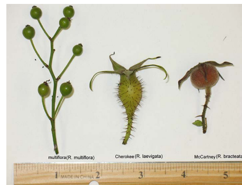
Figure 3. Hips (fruit) of multiflora, Cherokee, and McCartney roses.