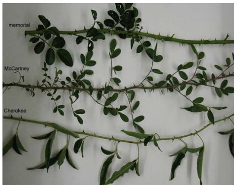
Figure 2. Stems of roses often misidentified as multiflora rose.