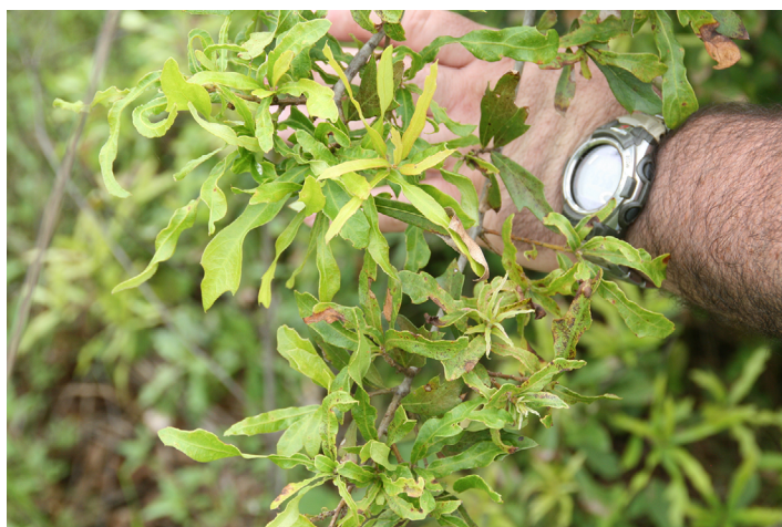
Figure 3. Twisting and abnormal growth of foliage characteristic of growth-regulator herbicides.

prescribed for use in landscape applications rarely cause woody species mortality, the herbicide is absorbed through the root systems of these species. This typically results in minor damage (easily observable in the form of leaf deformation and twig/branch dieback), but it can result in serious injury and/or mortality if dicamba is applied at greater than recommended rates and/or in repeated applications inside the root zone of woody species.