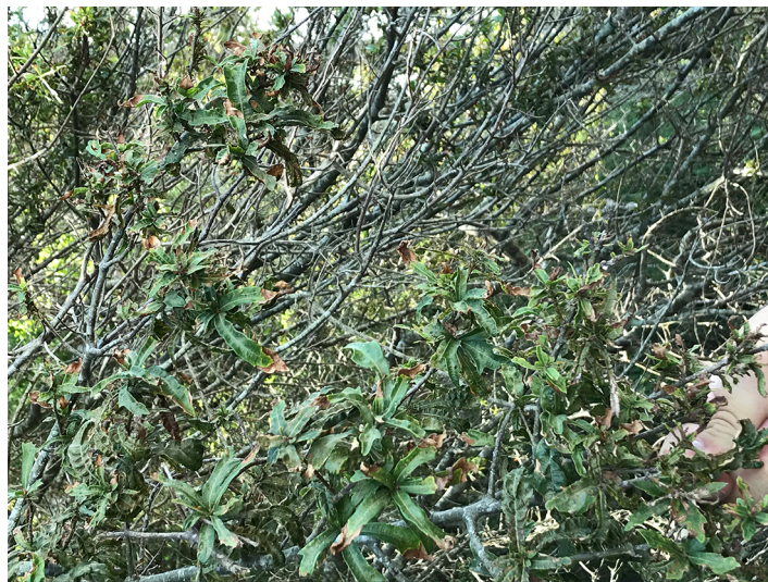
Figure 7. Epinastic growth of water oak leaves.

Abnormal development of plants caused by faster growth of tissue on the upper portion of stems and petioles causing bending, twisting, cupping, or other distortion.