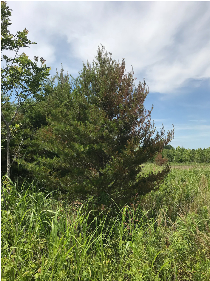
Figure 5. Virginia pine damage from light drift exposure to paraquat. Note the heavy one-sided damage typical of drift exposure.

Currently, well-meaning individuals who want to avoid the environmental and health effects of herbicides sometimes use salt to control landscape vegetation. They often apply salt solutions in walkway crevices and gravelled drives to control unwanted herbaceous vegetation. Remedial treatment is time-consuming and expensive, involving removal and replacement of affected soils.