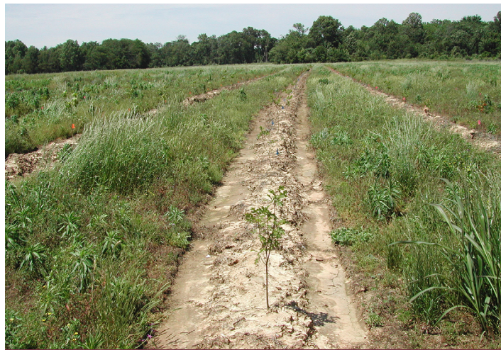
Figure 1. Control of herbaceous vegetation through the use of Oust XP (sulfometuron methyl). Note nearly complete herbaceous control and absence of damage to hardwood seedlings.

The herbicides listed below are commonly used in lawn settings to control a variety of undesired annual grass and broadleaf species. These herbicides include indaziflam (Specticle), pendimethalin (Pendulum), simazine (Princep), atrazine (Aatrex), prodiamine (Barricade), and dithiopyr (Diminsion). When applied correctly, woody species have very little root uptake of these herbicides. In addition, these herbicides are applied as pre-emergent treatments (before foliage appears) when most woody species are dormant. Subsequently, use of these herbicides does not typically result in tree or shrub damage. Always be aware of label cautions regarding soil pH, texture, and other factors that may be a concern when susceptible woody species are present.