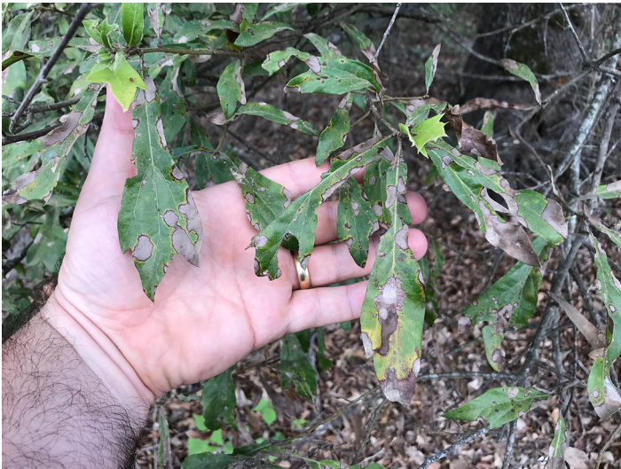
Figure 8. Spotting damage and necrosis resulting from paraquat drift onto water oak leaves.

Appearance of necrotic or chlorotic “spots” where tissue damage has occurred. Typically a result of drift contact.