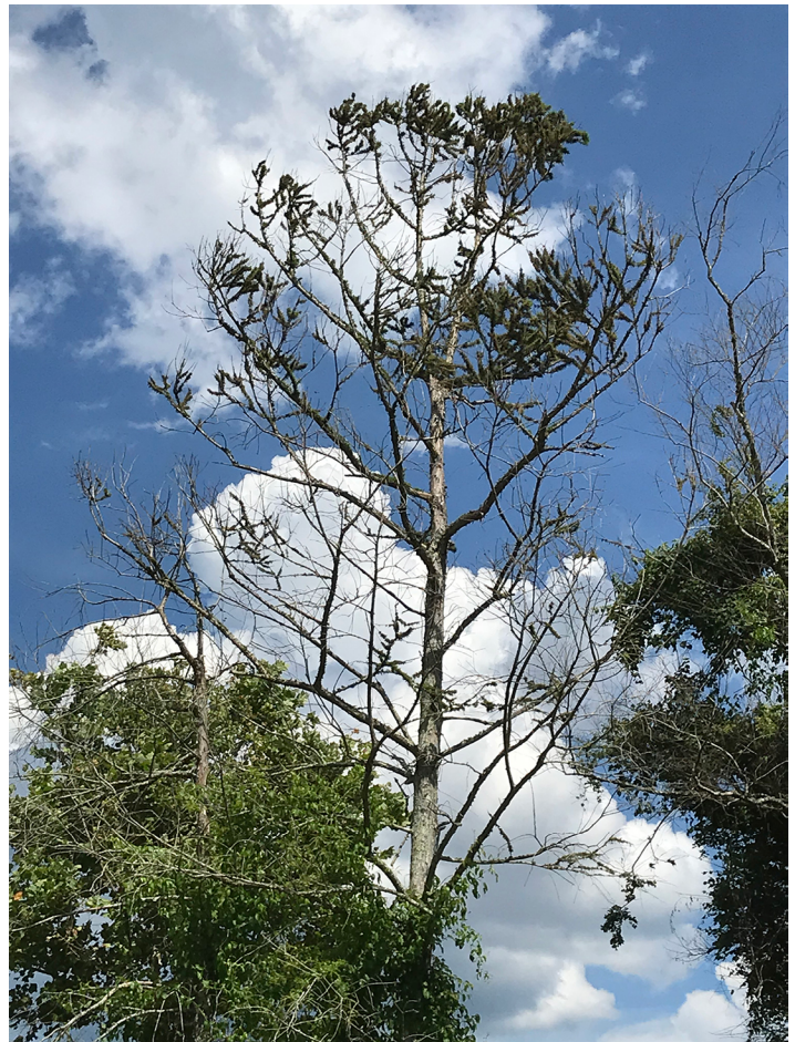
Figure 2. Growth-regulator herbicide drift effect on bald cypress near an agricultural field.

However, drift contact with foliage will result in leaf distortion and browning. Typically, drift of these herbicides does not result in woody species mortality but should still be avoided if possible. However, when rates exceeding label recommendations are used, 2,4-D and MCPP can be absorbed through the roots of woody species and result in injury and/or mortality.