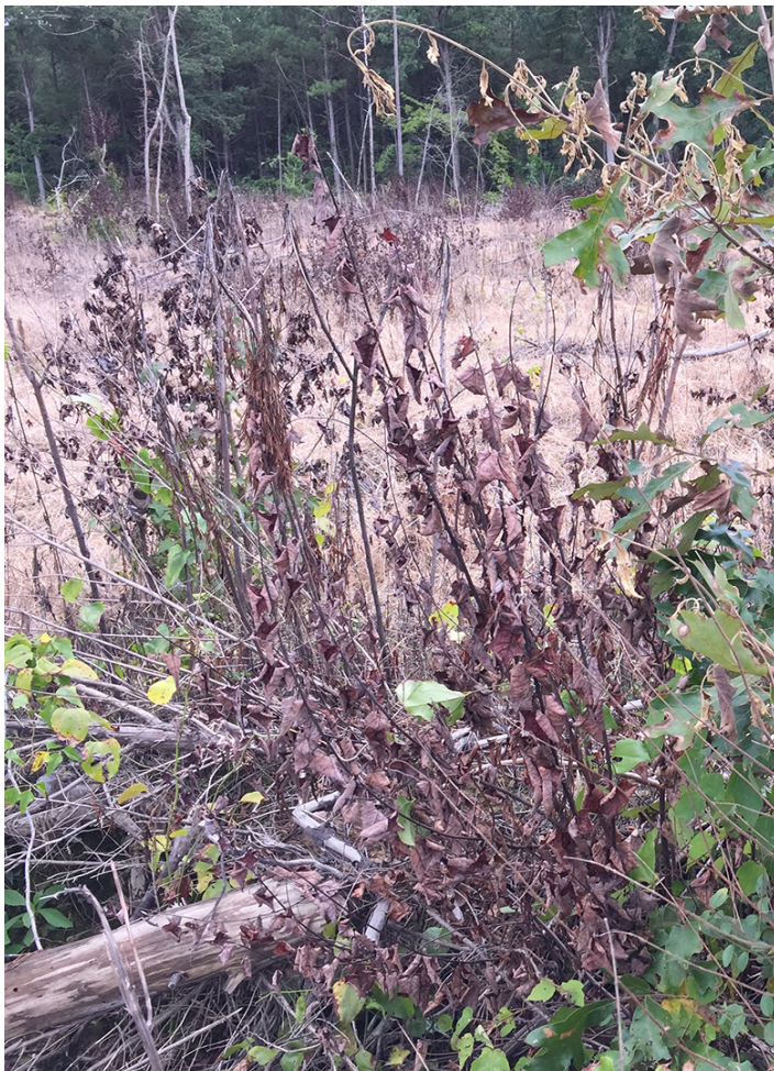
Figure 11. Herbicide-induced necrosis of red maple leaves.

Browning and desiccation of plant tissue caused by tissue death. Often starts as watery lesions leading to tissue desiccation and subsequent death of affected tissues.