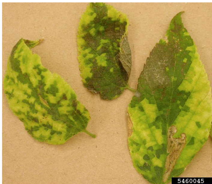
Figure 6. Leaf chlorosis.

Chlorosis is caused by chlorophyll loss and subsequent yellowing of foliage. Photosynthesis disruption can result from a variety of factors (e.g., nutrient deficiency, shading, herbicide damage). Chlorosis from herbicide damage will typically be bright yellow in the interveinal space contrasted with bright green secondary veins.