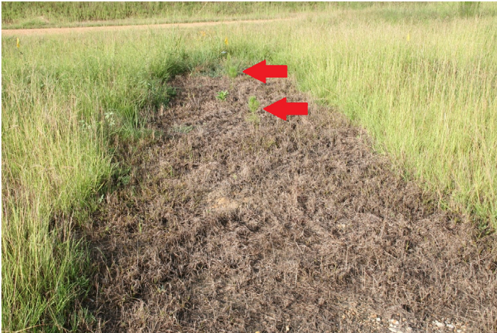
Figure 4. Typical grass control resulting from an application of Select (clethodim). Note grass control and lack of damage to loblolly pine seedling.

Currently, the two grass herbicides most commonly encountered in landscape application are fluazifop-P-butyl (Fusilade) and clethodim (Select). Properly implemented ground applications of these products will not result in damage to woody species. However, drift contact with leaves can result in damage if crop oil is used as a surfactant. Crop oil coming into contact with woody foliage will cause leaf browning but rarely mortality.