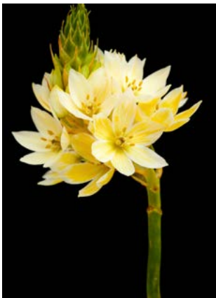
Star of Bethlehem, Chinchinchee Ornithagalum thrysoides

Lends a yellowish-green hue to floral designs. Small, gray berries are closely attached to stems. Responds well to glycerin preservation.