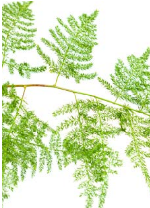
Plumosa Fern Asparagus setaceus

Perfect for soft, flowing wedding bouquets. It provides pattern and texture variation in designs. Layer it over masses of flowers for a veiling effect.