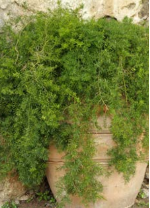
Asparagus Fern Asparagus densiflorus 'Sprengerii'

Unusual line foliage lending pattern, contour, and texture in floral arrangements. Like other asparagus ferns, it can often overwinter, especially if protected. Leaflike appendages (cladophylls) shed when foliage is losing freshness. This is true for all species of Asparagus .