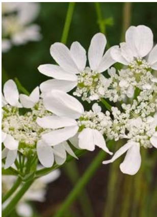
White Lace Orlaya sp.

Lush, tropical foliage lends an exotic, high-end look to interiors. Just a few leaves in a clear vase can create a stunning arrangement.