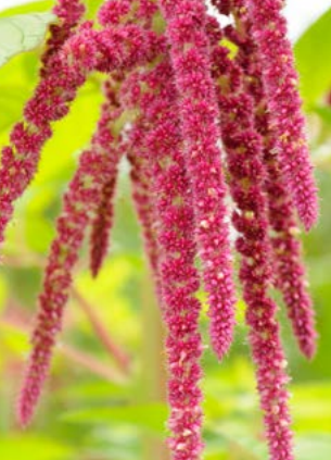
Love Lies Bleeding Amaranthus caudatus

Harvest when flowers are just beginning to unfold. Flowers will open in fresh flower food solution. Cut at base of stem or just above first set of leaves.