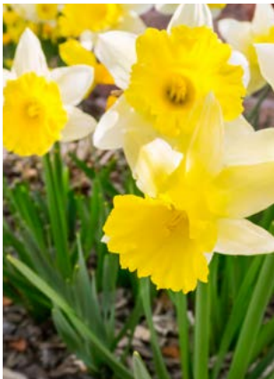
Daffodil Narcissus sp.

Statice grows best in full sun and in well-drained soil. Harvest stems before or just when small, white flowers open within the colorful, papery bracts. Bract colors include yellow, raspberry, and royal purple. To dry, gather five to ten stems with rubber bands and hang upside down in a warm space with plenty of air circulation, out of direct sunlight.