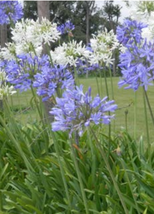
Lily of the Nile Agapanthus africanus

Some ornamental materials exude milky saps that can irritate the skin and eyes. Keep pets and children away from cut floral materials.