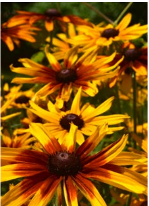
Black-eyed Susan Rudbeckia sp.

Take care to contain this plant in the garden because it can quickly spread. Berry-type fruits are encased in rusty-orange, papery coverings positioned along stems. Remove drying foliage for clean lines. Great in fall arrangements.