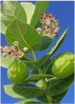
Balloonplant Milkweed Asclepias physocarpa

So many varieties; long-lasting when stored/displayed in a cool environment.