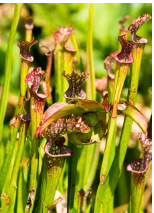
Pitcher Plant Sarracenia sp.

Deep green or variegated gray-green with cream, this foliage fills a design pattern quickly and is easy to grow. Oval-shaped leaves grow in rosettes, and stems quickly fill in an arrangement's pattern.