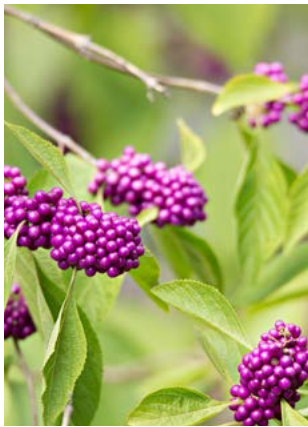
Beautyberry Calicarpa sp.

These leaves are the basis for creative leaf work in floral designs. Plant in shady locations and forget it because it takes a few years to establish in gardens.