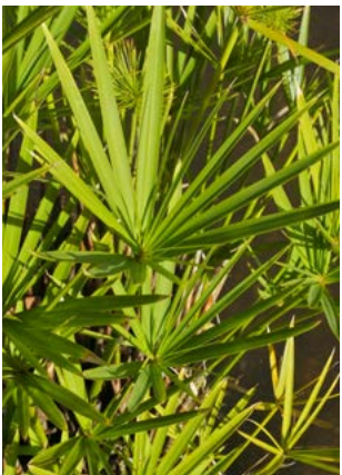
Umbrella Grass, Papyrus Cyperus alternifolius

Harvest when blooms are tight. For earlier blooms, force them into flowering by placing cut stems in fresh flower food solution indoors, where temperatures are warmer.