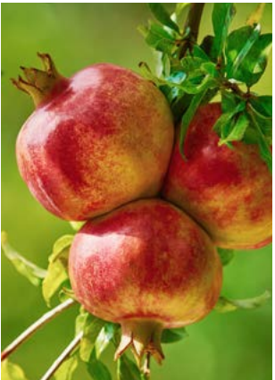
Pomegranate Punica sp.

Rice on the stem adds soft lines to floral designs. Bundle it for a harvest look and add to wreaths and arrangements.