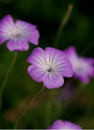
Corncockle Agrostemma githago

The flower structure is suitable before or after all florets abscise. Remaining green stems can be painted or glittered either in a fresh state or dried.