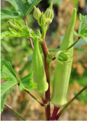
Okra Abelmoschus esculentus

Grow this plant for its arching branches and interesting flower parts. It is beautiful without its small, white, trumpet-shaped flowers because their bronze calyces remain. Can be sold as a cut flower or cut foliage, and as a line or filler material. Harvest stems at lengths from 12 to 48 inches.