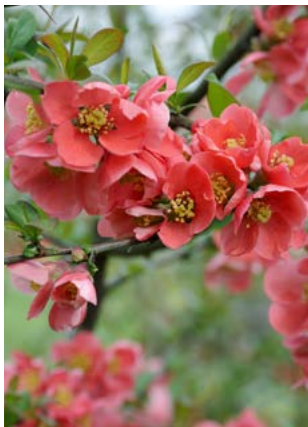
Flowering Quince Chaenomeles sp.

Harvest twigs, manually defoliate, and use in fresh or dried state. The twigs will be more flexible when fresh but still keep some resiliency when dried. Harvest exfoliated bark for design.