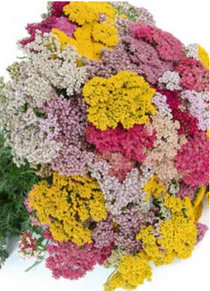
Yarrow Achillea sp.

Stems of Japanese maples and autumn-colored sugar maples add flair to floral designs. Vase life is only a few days before leaves curl and dry, but its color and pattern accent in floral designs is distinctive. Great candidate for pressed floral pictures. Cut stems around 24 inches long, and avoid harvesting stems with soft, juvenile growth in the spring.