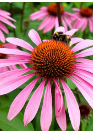
Cone Flower Echinacea sp.

Flourishes in moist to wet soils. Keep controlled or plant in wide, open areas because clumps can take over a space. Makes a good houseplant if kept constantly moist to wet. Harvest the long stems, which are topped with tufts of foliage.