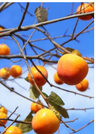
Persimmon Diospyros sp.

This fiery-colored cousin of gladiolus grows from corms that freely multiply. Produces graceful cut flowers that, if left on the plant, produce bead-shaped, bronze fruits. Stunning in summer and fall arrangements.