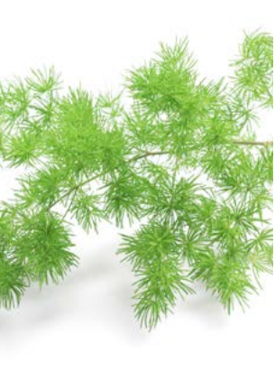
Ming Fern Asparagus macowanii

Versatile foliage for floral arrangements and garlands. Take care to avoid thorns, which can lodge into skin and cause irritation. Individual cladophylls (leaf-like blades) will fall off stems when foliage is not fresh. Prolific growth habit once the plant is established.