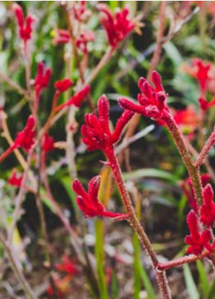
Kangaroo Paw Anigozanthos sp.

Dramatic tassels of flowers. Designers remove the foliage in order to emphasize the clean, hanging line.