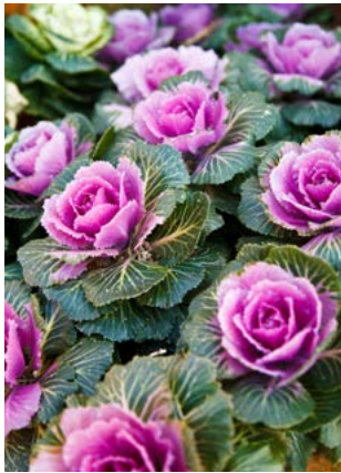
Ornamental Kale Brassica sp.

Perfect for soft, flowing wedding bouquets. It provides pattern and texture variation in designs. Layer it over masses of flowers for a veiling effect.