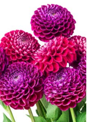
Dahlia Dahlia sp.

Egg-shaped pods are lime green and covered in hairs. Unique in floral designs. Stems exude milky sap that can irritate skin.