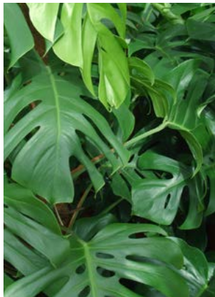
Monstera Monstera deliciosa

Black-eyed Susans are very easy to grow. Bright gold flowers liven up designs, and, if left on the plant, dried seed heads are nice in fall arrangements.