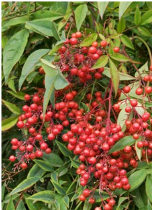
Nandina Nandina domestica

Yellowish-green cut foliage adds contrast of texture and pattern in floral designs. Lends a spicy fragrance when crushed or brushed. Star-shaped seed pods are approximately 1 inch across.