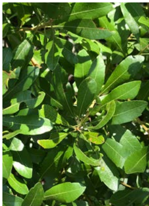
Southern Wax Myrtle, Bayberry Morella cerifera

Growing to the size of a small tree, the base stems of this plant have numerous curves and turns. Stems can be used in fresh or dried state, but remove foliage because it dries quickly and obscures the curvy lines.