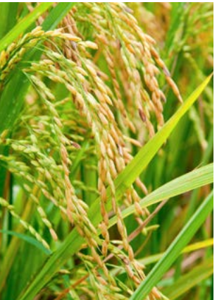
Rice Oryza sativa

Nandina offers a graceful, lacy pattern as well as color accent to floral designs. Vase life is fair, but should not limit this plant from the marketplace as a cut ornamental foliage. Harvest woody stems at least 2 feet in length.