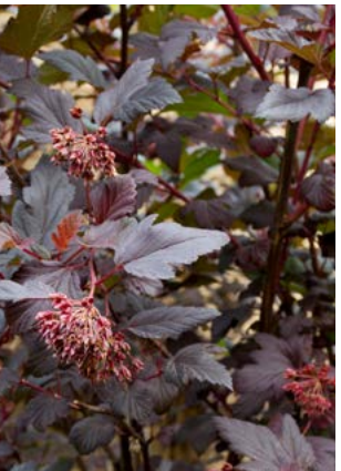
Physocarpus, Ninebark Physocarpus sp.

Resembling Queen Anne's lace, this white filler flower looks fine by itself or combined with other flowers in fresh floral designs.