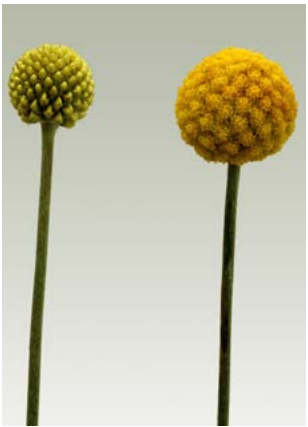
Billy Buttons Craspedia globosa

Give it lots of room and sun to get the best return. Vivid violet, milky white, or pink berries are clustered on long stems. Remove foliage before using in arrangements because the foliage will decline faster than the berried branches and hide the unique line.