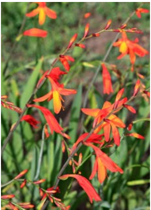
Crocasmia, Montbretia Crocasmia sp.

A must-have. Consider these showy flowers for wire-and-tape or adhesive mechanics for flowers-to-wear designs. Showier than a gardenia, though most are not scented; fall and winter color.