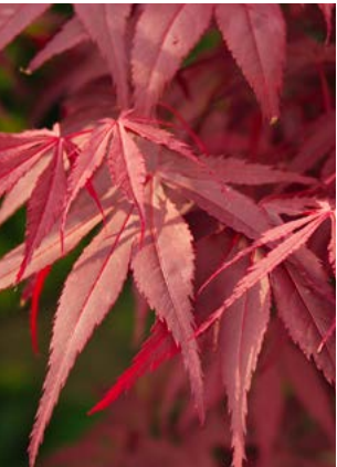
Maple Acer sp.

Fresh or dried okra on the stem is terrific in floral designs. The individual dried pods are great for a rustic touch in designs, including tabletop arrangements, wreaths, and many more.