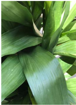
Cast Iron Plant Aspidistra elatior

Large blooms create focal impact in fresh floral designs. Dahlias grow from tubers, which are swollen stem tissues that grow underground.