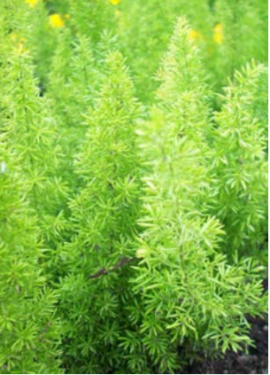
Foxtail Fern Asparagus densiflorus 'Myers'

Unusual line foliage lending pattern, contour, and texture in floral arrangements. Like other asparagus ferns, it can often overwinter, especially if protected. Leaflike appendages (cladophylls) shed when foliage is losing freshness. This is true for all species of Asparagus .