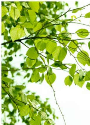
River Birch Betula nigra

Grow for branches with attached fruit, or impale detached fruit on skewers and use in designs for focal impact.