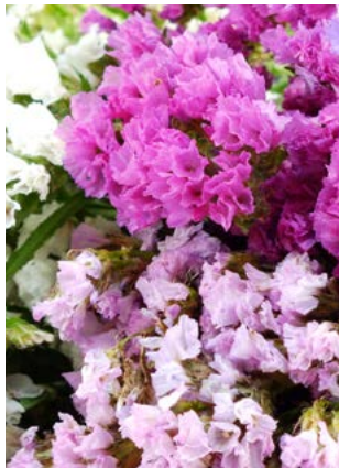
Statice Limonium sp.

Stems with attached fruit create great interest in summer and fall arrangements. Individual fruits can be used for focal-area emphasis. Insert a pick, a slender dowel, or a few wooden skewers into the fruit to make an artificial stem, then anchor into floral design mechanics.