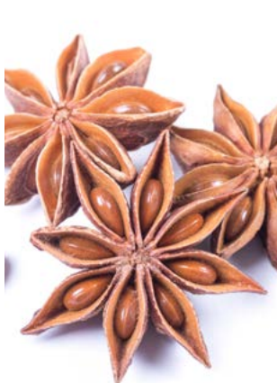
Star Anise Illicium floridanum

Yellowish-green cut foliage adds contrast of texture and pattern in floral designs. Lends a spicy fragrance when crushed or brushed. Star-shaped seed pods are approximately 1 inch across.