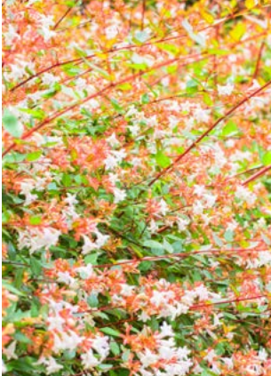
Glossy Abelia Abelia x grandiflora

Grow this plant for its arching branches and interesting flower parts. It is beautiful without its small, white, trumpet-shaped flowers because their bronze calyces remain. Can be sold as a cut flower or cut foliage, and as a line or filler material. Harvest stems at lengths from 12 to 48 inches.