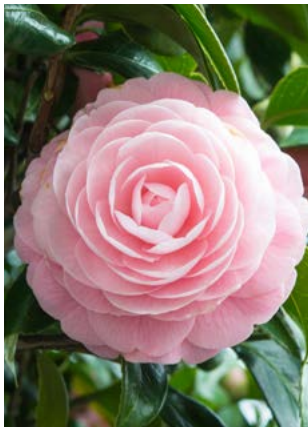
Camellia Camellia japonica , C. sasanqua

These leaves are the basis for creative leaf work in floral designs. Plant in shady locations and forget it because it takes a few years to establish in gardens.