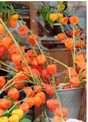
Chinese Lantern Physalis alkekengi

Harvest daffodil flowers before the petals open. They can be wrapped in newspaper and dry-stored in refrigeration for up to 2 weeks, then recut and placed in fresh flower food solution.