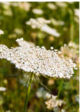
Queen Anne's Lace Daucus carota

A type of yarrow, but with a ball-shaped flower head. Works well in both fresh and dried floral designs.