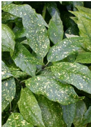
Aucuba Aucuba japonica

Daucus and Ammi , two types of Queen Anne's lace, are popular filler flowers in bouquets and arrangements.