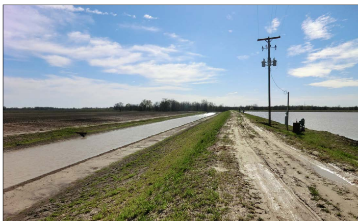
Figure 1. An on-farm water storage system typically consists of a pond (right) and a tailwater recovery canal (left).

An on-farm water storage (OFWS) system is a structural best management practice that captures and stores surface water runoff so that it can be used at a later time for irrigation. These systems can capture runoff both from rainfall and tailwater from furrow irrigation, and they can be constructed with only a storage pond, with an enlarged tailwater recovery (TWR) ditch, or with a TWR ditch and a storage pond (Figure 1). The pond is typically constructed on an area of the farm that is less productive, such as a low-lying area that does not drain well. The TWR ditch and pond are positioned where they can capture adequate runoff yet remain accessible to fields that will be irrigated using the stored water. The designs of the systems vary depending on where in Mississippi they are installed. It is important to note that Section 404 of the Clean Water Act (CWA) requires a permit for the discharge of dredged or fill material into waters of the United States, which includes wetlands.