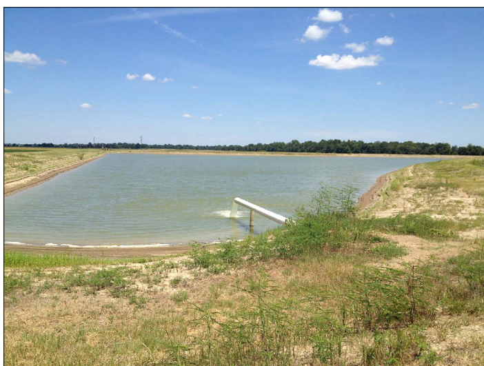
Figure 3. On-farm water storage pond.

Due to the flat terrain in the Mississippi Delta, fields are usually precision-leveled, and pads and pipes are installed to ensure that runoff from surrounding fields drains into the TWR ditch. From there, it is pumped into the storage pond, where it is held until needed for irrigation. The storage pond is typically built up from soil captured through the land-leveling process, with minimal excavation. OFWS systems that are constructed with financial assistance from the NRCS are usually designed by an NRCS engineer to have a ratio of 1 acre storage for every 16 irrigated acres. Storage ponds are usually around 8 feet deep with a 4-foot berm and a minimum 6-inch overflow pipe (Figure 3).