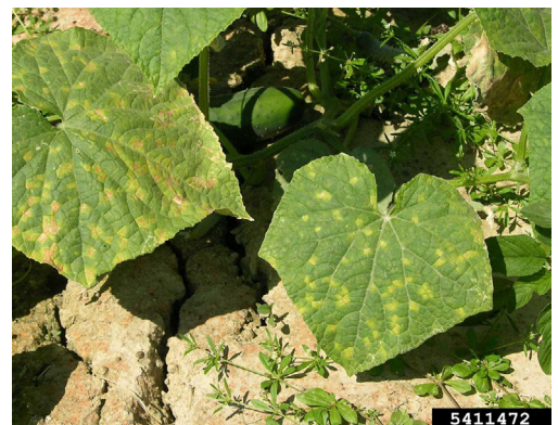
Figure 4. Symptoms of downy mildew on cucumber.