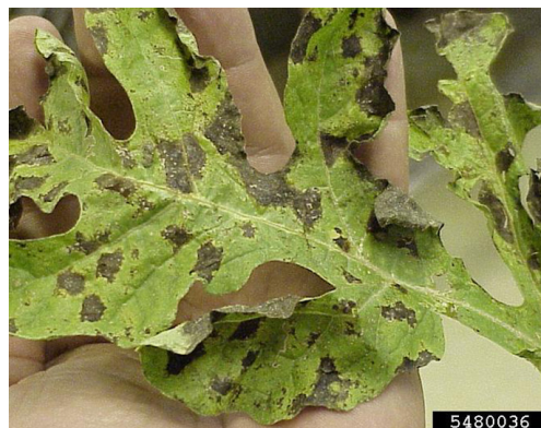
Figure 3. Symptoms of downy mildew on watermelon.