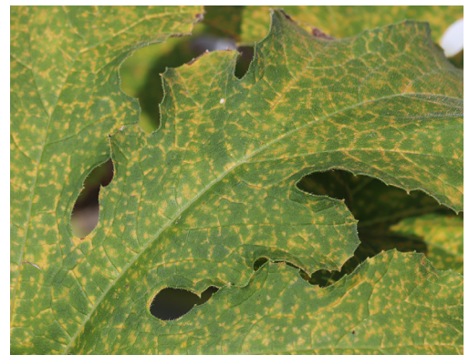
Figure 2. Symptoms of downy mildew on pumpkin.