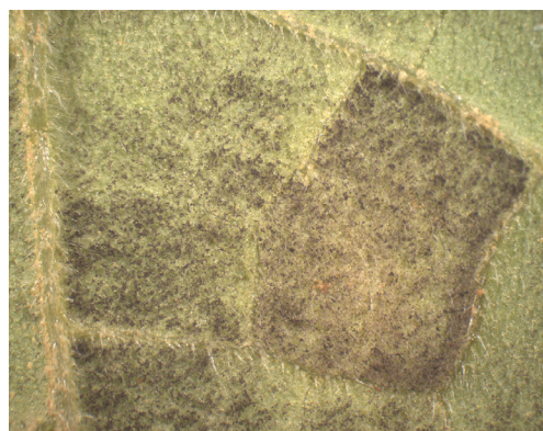
Figure 5. Gray- to purple-colored pathogen growth (sign) on the lower surface of a squash leaf.