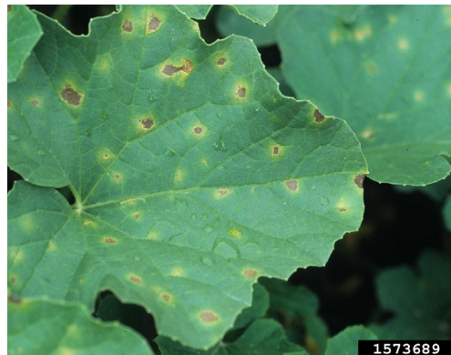
Figure 1. Symptoms of downy mildew on cantaloupe.

Signs and symptoms of downy mildew typically occur only on leaves. Leaves of all ages may be affected. Symptoms appear between 3 and 12 days after infection and begin as slightly yellow to bright yellow lesions on the upper leaf surface. Lesions may remain yellow or may turn brown. In most cucurbits, lesions have irregular margins ( Figures 1, 2, and 3 ); however, in cucumbers, lesions are angular ( Figure 4 ). The lesions may expand to cover much of the leaf surface, eventually resulting in the death of the entire leaf. Under favorable environmental conditions, the pathogen may produce gray- to purple-colored structures on the lower surface of leaves ( Figures 5 and 6 ) below the yellow lesions present on the upper surface of leaves.