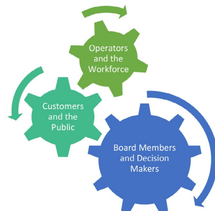
Figure 1. Communicating at work.

Board members and operators need teamwork and communication to operate any public utility. Board members, operators, and consumers are all focused on the same objective—having access to an affordable and reliable public service for the community. Managers and board members who attempt to build open lines of communication with employees and operators are more likely to develop efficient working relationships, improve job performance from employees, and encourage higher productivity levels. Board members should use diverse communication techniques to interact with employees, inspire improvement, deliver information, request feedback, and motivate employees. Studies examining the effects of open communication on the often-strenuous relationship between employees and management suggest open communication is an effective approach to increase employees’ performance and dedication. Open communication indicates the organization cares about the well being of employees and values employee contributions. When managers communicate openly and welcome employee input, which creates upward and downward lines of communication, employees are more likely to be dedicated and work more effectively for the organization. See Figure 1 .