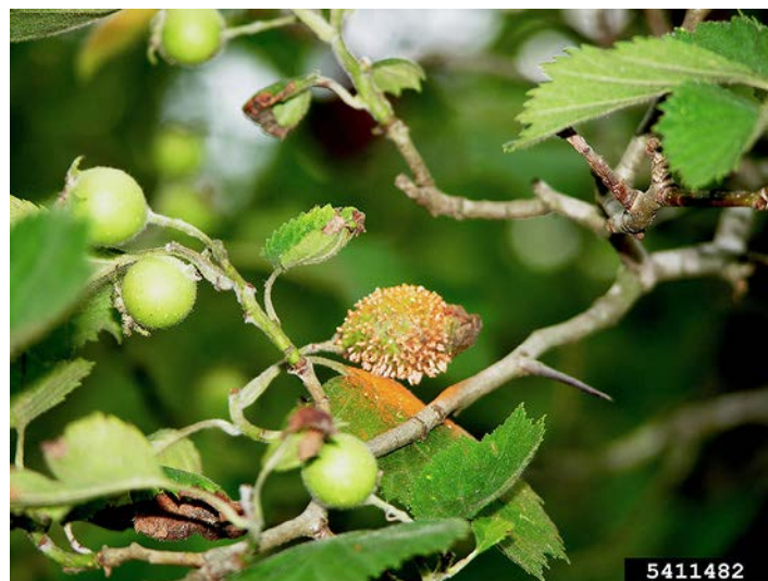
Figure 1. Quince rust on mayhaw fruit.

Twigs, fruits, thorns, petioles, and leaves of mayhaws may be infected by rust fungi. Symptoms are visible about 7–10 days after infection. Fungal infection causes cells to grow abnormally large (hypertrophy), giving plant tissue a swollen appearance. Infected mayhaw twigs have spindle-shaped swellings. Leaf veins, common infection sites, swell and diseased leaves curl and die. Infected fruit appear covered with white, tube-like projections about 2–3 millimeters long. Each white tube splits open lengthwise, revealing orange spores on the fruit surface (Figure 1). Spore stages of the fungus are produced on infected twigs, fruits, petioles, and bases of thorns. Infected tissue typically dies after spore production, resulting in twig dieback.