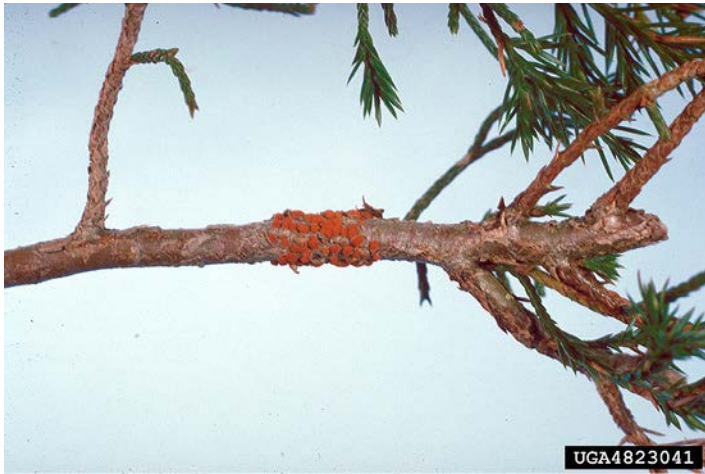
Figure 2. Quince rust on Eastern red cedar.