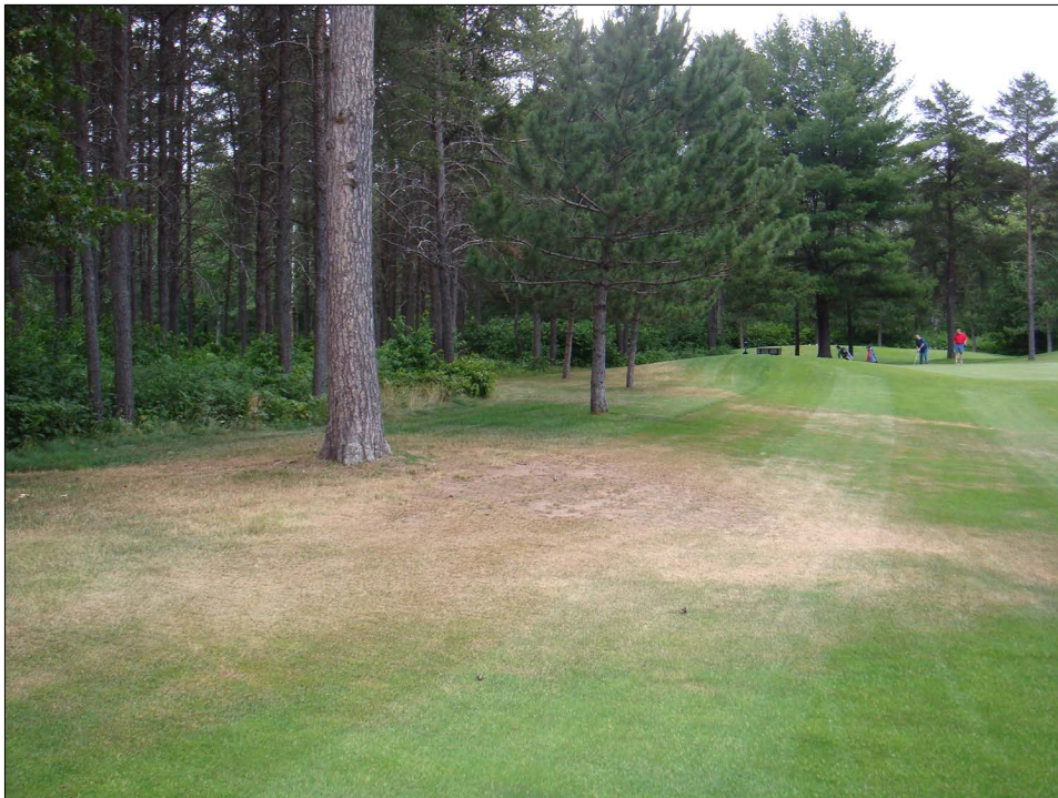
Figure 2. Drought stress due to root competition from a nearby tree.