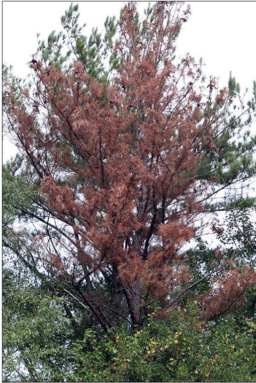
Figure 2. Dead and fading tree killed in an Ips infestation.

Ips infestations typically do not appear in defined “spots,” as SPB infestations typically do. Ips tend to cause scattered mortality of only the weakest trees throughout stands. Consequently, Ips damage is generally distributed in a much more scattered pattern throughout a pine stand compared to that of the SPB. In many cases, the damage a stand suffers from an Ips infestation is limited to only one or a few trees (Nebeker, 2004). If Ips do persist, they are likely to create a checkerboard pattern of fading and healthy trees (Stone et al., 2007; Figure 2 ). This pattern is dramatically different from SPB infestations, which can continuously spread from the initially attacked tree unless environmental conditions or management activities halt beetle activity.