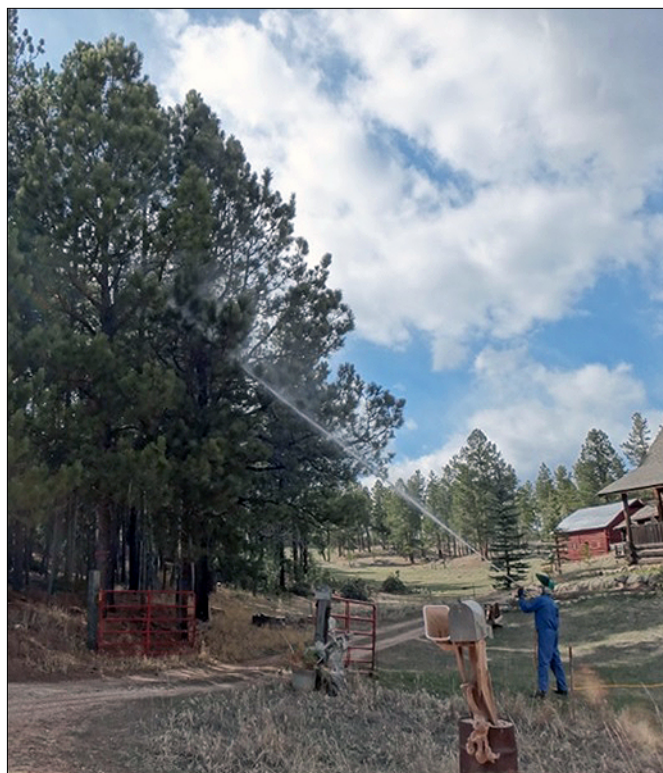
Figure 4. Ips prevention through chemical application on highly valued residential trees.

Ips typically attack trees too weak to produce enough resin pressure to form pitch tubes. In contrast, SPB can attack trees with high vigor that have sufficient resin pressure to produce the characteristic pitch tubes.