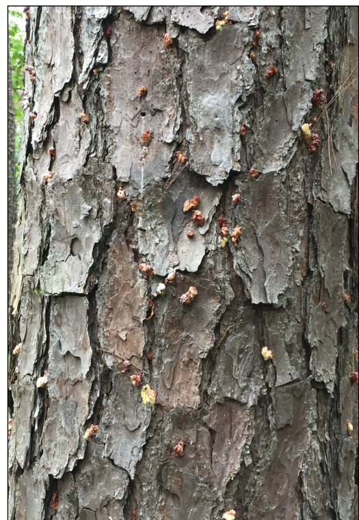
Figure 3. Pine bark beetle pitch tubes.

Symptoms of an Ips infestation are the tree’s response to attack. Fading crowns, dead trees, pitch tubes, and sloughing bark are all symptoms of an Ips attack. Signs of an attack that relate to the beetle directly include galleries, emergence holes, boring dust, frass (beetle excrement and sawdust), and Ips beetles or larvae themselves. Symptoms of an Ips infestation are easier to recognize than signs. Symptoms of bark beetle infestations are usually the first thing observed in an infestation, but, through closer inspection, signs allow you to identify the type of bark beetle present. One of the signature symptoms of an SPB infestation is the popcorn-shaped pitch tubes along the stem (Thatcher et al., 1980; Figure 3 ). While Ips species also can cause pitch tubes, they are often lacking in trees under attack by Ips beetles, because