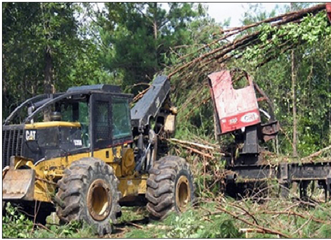
Figure 5. Skidder distributing slash from a loading deck into a thinned pine stand.

Slash distribution is feasible for logging crews. After delivering a load to the deck, a skidder picks up slash material and deposits it along skid trails and thinning rows/corridors while retrieving the next load (Figure 5). Spreading potential Ips beetle habitat throughout your residual trees may seem strange, but logging equipment passing back and forth and exposure to the elements will make most redistributed slash less suitable for Ips . Slash distribution may also provide some protection against soil compaction from logging equipment. If slash redistribution is not possible or desired, residual slash piles can be burned. However, if burning is employed, take care to ensure residual trees are not scorched.