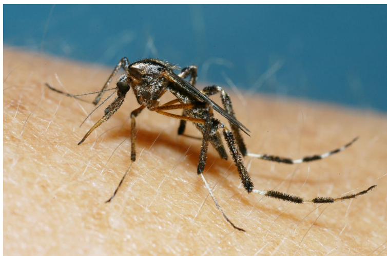
Figure 1. Adult female Psorophora mosquito, a vicious mosquito in Mississippi (Photo courtesy Dr. Blake Layton, MSU Extension).

Mississippi has 60 species of mosquitoes, but only five or six of them are significant pests. Most are relatively rare and associated with a narrow host range or unusual ecological niche. For example, some species feed only on frogs, so they have little or no interaction with humans, and others live only in certain pitcher plants along the Gulf Coast. The major pest mosquitoes in Mississippi are those that breed in high numbers and are important because of nuisance biting and/or disease transmission.