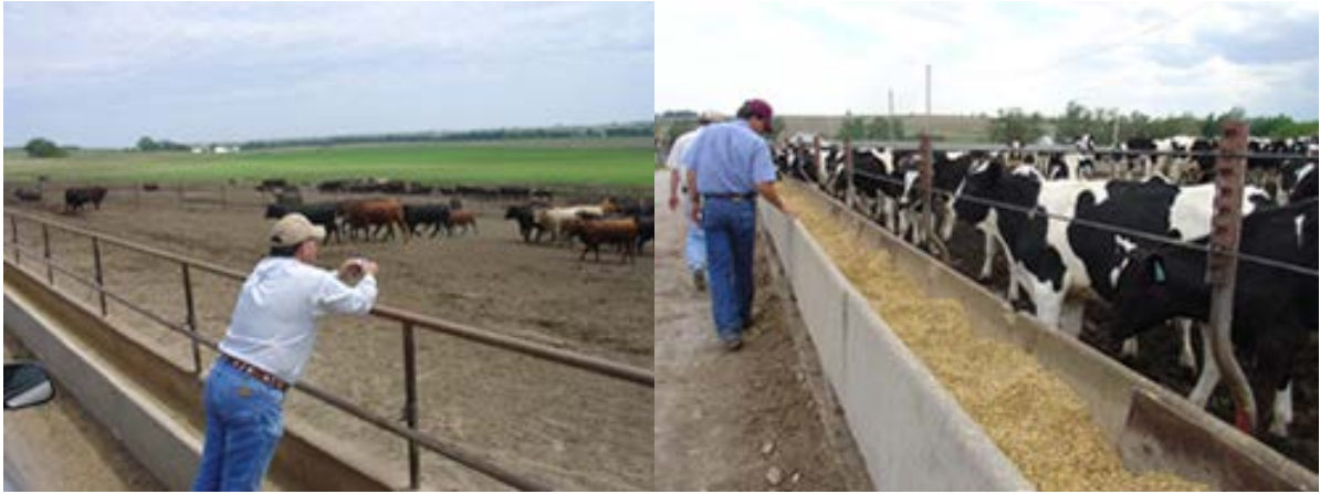
Mississippi beef cattle producers visiting prospective feedlots.

Many feedlots offer virtual tours. However, it may be more constructive to visit the feedlot to get a firsthand look at the feeding operation. Look for potential problems, such as stale feed in the bunks, excessive mud, or poor drainage. Be sure to note employees' routines. Observe the pen riders to see if they are taking the time to look at every calf in the pen. As part of an evaluation of the nutritional program, see if the cattle appear generally content.