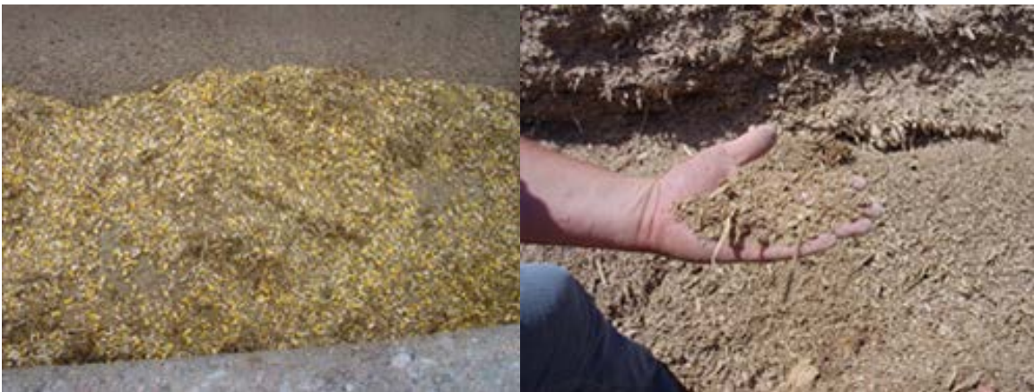
Nutritional program information gathering is essential in selecting a feedlot.

Commercial feedlots are specialists in feeding cattle high concentrate diets to finish them to harvest weights and endpoints. These operations make money by selling feed and services to producers. Services are commonly charged as yardage, yardage plus feed markup, or feed markup alone. Understanding the feedlot's nutritional program and process for determining cattle endpoint is important before placing cattle on feed. Getting the best value from cattle feeding often requires estimating anticipated expenses and cattle performance and calculating key economic and performance measures. This allows comparisons of feedlot programs and associated costs.