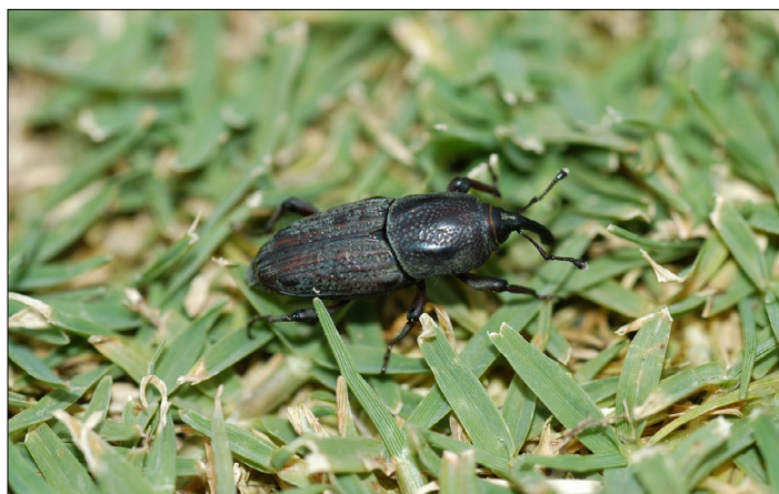
Figure 2. Adult billbugs usually remain hidden during the day and become active at night. Use a flashlight and scout after dark to check for adults.

Billbug damage initially appears as isolated, hand-sized patches of dying, discolored turf; however, these patches may overlap when populations are heavy. This damage is often most obvious in the fall, but it can be difficult to detect when turf is also browning due to drought. Although the adults feed on the runners and stolens, most damage is caused by the larvae, which feed heavily in crowns and stolens. One can verify the presence of billbugs by checking in and around the damaged area to see if stems break easily when tugged,