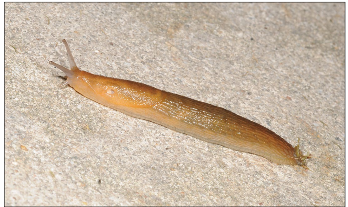
Figure 8. Slugs do not have shells and are more likely to damage plants or to cause nuisance problems than the snails found in Mississippi.

Slugs (Figure 8) and snails are common pests in and around home lawns. They can damage certain tender ornamental plants and vegetables. Slugs are nocturnal and often move onto patios and carports at night, leaving trails of clear, dried mucus as evidence of their passage. Slugs are attracted to areas where pets are fed and will often concentrate in such areas. These pests are best controlled with specially formulated baits. Because many of these baits are toxic to pets and wildlife, be sure to use them properly. Treatments containing iron phosphate are labeled for use around domestic animals.