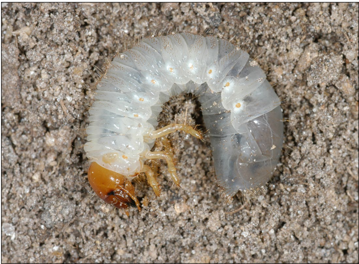
Figure 4. Their characteristic C-shape and white bodies with brown heads make white grubs easy to recognize. Several species of white grubs damage turf, but control is similar.

Check for grubs in the spring or summer by cutting several 1- to 2-foot-square samples 2 to 3 inches deep, and lifting out, or rolling back, the turf square to look for grubs. If you find an average of three to five grubs per square foot, your lawn probably needs treatment. Water grass before treatment if soil is dry (this causes grubs to move nearer to the surface of the soil), and thoroughly water again after treatment (this leaches the insecticide into the soil where the grubs are feeding). Large amounts of thatch can interfere with effective treatment of white