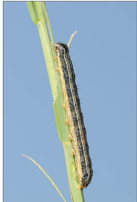
Figure 6. Fall armyworms sometimes cause heavy defoliation of bermudagrass lawns and commercial bermudagrass turf.

Sod webworms cut grass blades above the thatch line and pull them into their tunnels to eat. Closely cropped grass may look like small brown patches. If infestation is heavy, patches may run together to form irregular brown patches. Adult moths are weak fliers and live only a few days. There may be two or three generations per year.