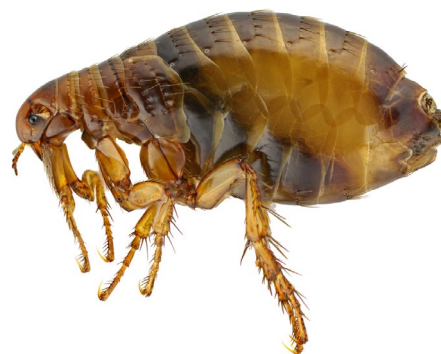
Figure 13. Fleas in lawns are coming from pets or other animals that are spending considerable time resting in or near the area where the fleas are found.

Extension Publication 2597 Control Fleas on Your Pet, In Your House and in Your Yard addresses control of fleas on the pet and indoors. Fleas can be controlled in the yard by applying a spray or granular insecticide labeled for use against fleas in home lawns. When attempting to control fleas in a home lawn situation, keep in mind you will not have lasting success unless fleas are also controlled on all