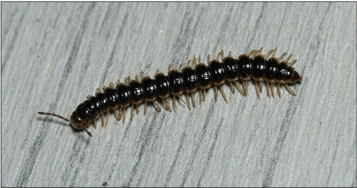
Figure 10. Garden millipedes spend most of their time hidden in mulch and leaf litter, but can become serious nuisances during prolonged wet, rainy periods.

Heavy millipede infestations are difficult to control effectively with insecticides because the millipedes that are killed are constantly being replaced by new arrivals. Unless they have access to moisture, millipedes on carports