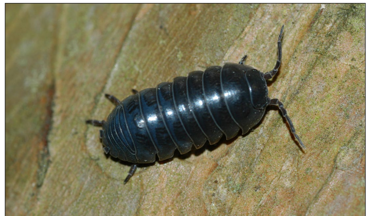
Figure 9. When they feel threatened, pill bugs can roll their segmented bodies into a tight, pill-like ball, much like armadillos.

Pill bugs, also known as “roly-polies” or sowbugs, can be a problem around the home lawn when they occur in high numbers (Figure 9). These are not insects but are land-dwelling crustaceans related to shrimp and crayfish. Pill bugs prefer moist, protected environments with large amounts of decaying organic matter. Heavy populations of pill bugs often occur in heavily mulched flower beds or areas with heavy accumulations of leaf litter. Like slugs, pill bugs can damage tender ornamental plants, such as hostas. Pill bugs can be controlled with baits containing the active ingredient carbaryl or spinosad, or with contact insecticides applied as sprays or granules.