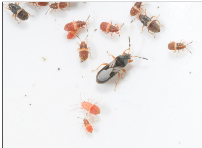
Figure 3. Adult chinch bugs are a little less than ¼ inch long and are black with white wings, but young nymphs are pink or red-colored and become darker as they grow.

Scout turf on sunny days by parting stems and looking for the small, reddish nymphs and/or the black and white adults in the crown region or running across the exposed soil. Another method is to remove both ends of a gallon-size can, press one end of the can 2 to 3 inches into the turf, and then fill the can half-full with water. If chinch bugs are present, they will float to the top within a few minutes. When using this method, it is important to check several sites, choosing areas where yellow and green grass meet. Treatment is recommended when chinch bug numbers exceed approximately 20 bugs per square foot. If chinch bugs are identified as the cause of