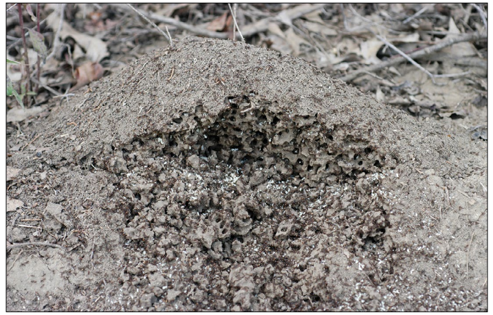
Figure 1. Fire ants are one of the most common, and most vexing, insect pests of home lawns throughout the South. The white items in the photo are the brood, or immature fire ants.

Apply baits when the ground is dry and when ground temperatures are between 70°F and 90°F with no forecast of rain. The insecticides used in granular baits are intended to act slowly. Foraging ants pick up baits, carry them back to the colony, and pass them among the ants in the colony, including the queen. This slow activity allows time for the insecticide to spread throughout the colony. Depending on the specific bait used, maximum control takes 2 to 6 weeks. In summer and fall, apply bait in the afternoon when temperatures are cooler.