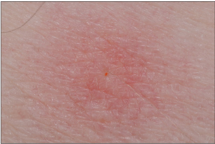
Figure 15. The itching and irritation caused by a chigger bite is far out of proportion to the size of the chigger. The tiny orange spot in the center of the welt is the chigger.

Chiggers are rarely found in well-maintained lawns, but they can be very common in overgrown, brushy, or weedy areas. This is because the moisture in such areas is favorable to the development of springtails and other small insects that adult and nymphal chiggers eat. These areas also harbor large numbers of the small animals that serve as hosts for larval chiggers. Therefore, regular mowing and brush removal is one of the best methods of controlling chiggers in the home lawn. Maintaining