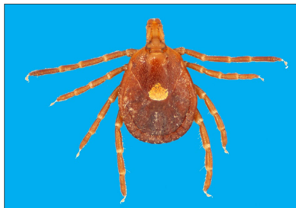
Figure 14. Lone Star ticks are one of several tick species that occur in and around southern lawns. Ticks can vector several medically important diseases.

Ticks are usually brought into the home lawn aboard pets or other animals, including stray and wild animals that frequent the area. Unfortunately, ticks in the home lawn are likely to seek their next blood meal from any person who happens to brush against them. Therefore, the first step in controlling ticks in the home lawn is to