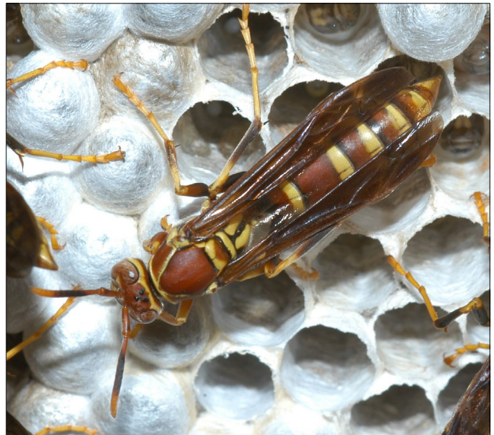
Figure 12. Guinea wasps, Polistes exclamans , is one of several species of paper wasps that occur in the South.

in thick shrubbery, in thick grass or weeds, in equipment that is stored for long periods, or in other protected locations. Single overwintered females build new nests each spring, but, by late summer, paper wasp nests can be 6 inches or more in diameter and contain dozens of wasps. It is a good idea to check for wasps before beginning work such as pruning shrubs or moving equipment that may harbor wasp nests. Give shrubs a vigorous shake with a rake or other long-handled implement and promptly step back to observe whether or not any wasps fly out. Use a similar approach before moving equipment, like that fertilizer spreader that has been hanging in the tool shed, or other items that may harbor wasp nests. If you see wasps, determine the location of the nest and treat as described below.