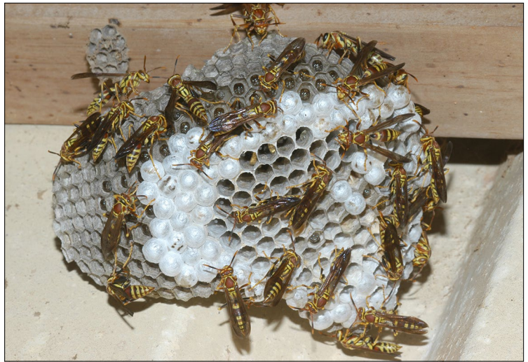
Figure 11. Paper wasps will sting aggressively if they feel their nest is threatened. Nests located in high traffic or sensitive locations should be proactively controlled.

Paper wasps build their nests in areas that are protected from rainfall, such as under eaves of buildings,