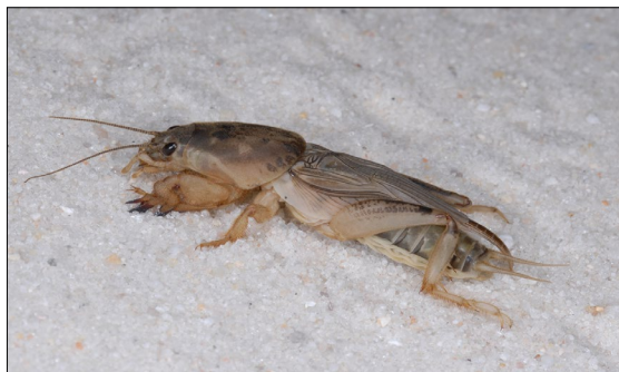
Figure 5. Mole crickets use their strong, highly modified front legs to tunnel through soil, damaging grass roots as they do and creating tunnels that resemble miniature mole tunnels.

Before treating for mole crickets, be sure the turf is well watered because mole crickets tend to burrow deeper in dry soil. Making sure that the turf has been well watered in the several days before treatment assures that mole crickets will be close to the surface where the insecticide can reach them. With most mole cricket treatments, it is also important to water immediately after treatment in order to leach the treatment into the soil where it can contact the mole crickets.