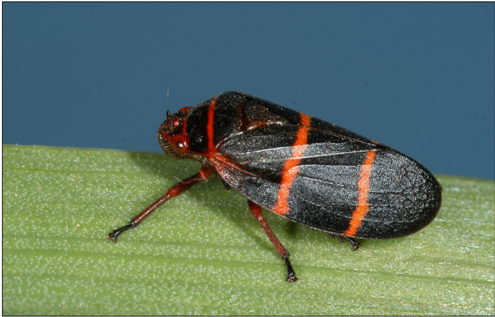
Figure 7. Adult two-lined spittle bugs are dark maroon with two orange stripes across their wings (about 3⁄8 inches long).

This insect produces two or three generations per year, and the adults of the second generations will emerge