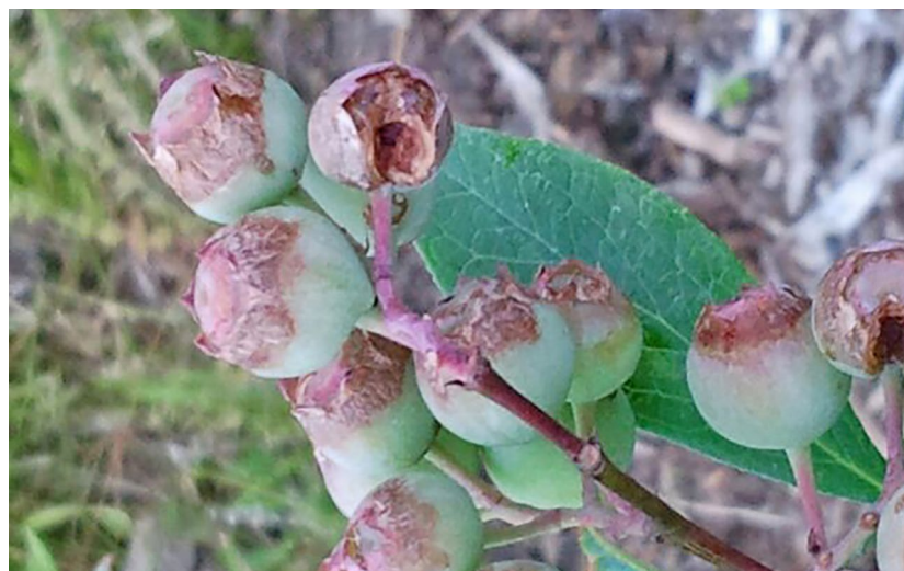
Figure 12. Cold injury often is seen on the blossom end of developing blueberry fruit. The scarred tissue will make this fruit unmarketable. E. T. Stafne