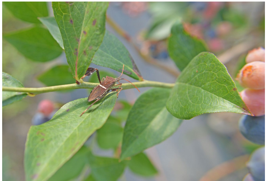
Figure 9. A leaf-footed bug on a blueberry stem. These insects can cause significant injury to fruit. E. T. Stafne

Leaf-footed bugs and stink bugs can damage larger green and ripe fruits ( Figure 9 ). They also can raise their brood within fruiting clusters. Immature bugs (nymphs) resemble smaller adults, except that they are often more brightly colored with orange or red markings. Nymphs are wingless, although wing pads are visible. Apply insecticides as needed once they are identified.