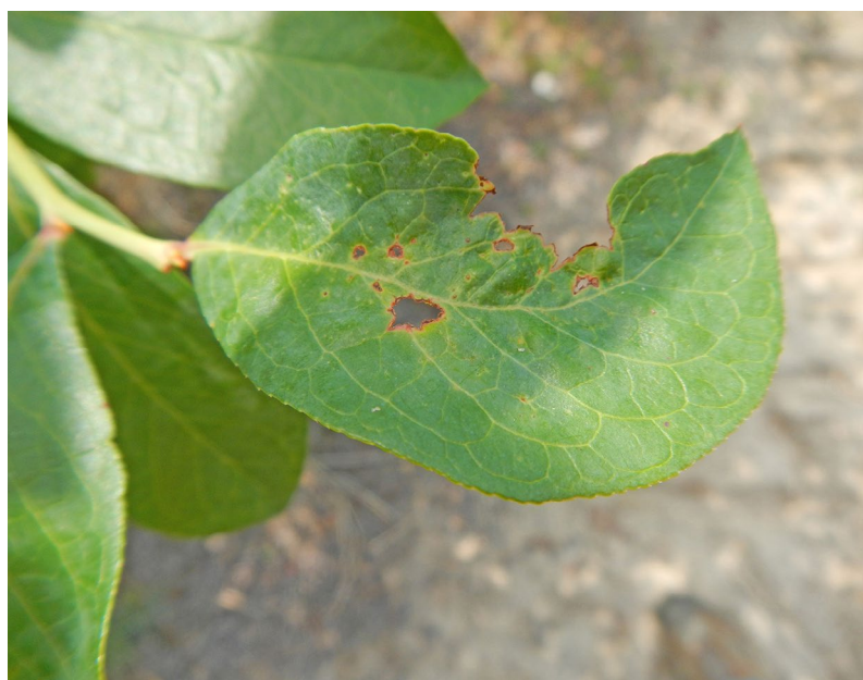
Figure 8. Leaf damage caused by blueberry gall midge. E. T. Stafne

Blueberry gall midges are tiny, mosquito-like flies about one-twelfth of an inch long. Immature larvae (maggots) feed on blueberry plants' floral and leaf buds. For most rabbiteye cultivars, vegetative feeding causes little damage ( Figure 8 ). However, some rabbiteye cultivars are highly susceptible to both flower and vegetative bud injury. Blueberry gall midge occurs sporadically but can cause 20 to 80 percent flower bud/fruit loss. Begin a pre-bloom insecticide spray program for blueberry gall midges only after the pest has become active on the farm or in nearby fields. Gall midges lay eggs on warm, late-winter days, usually after a heavy rainfall. Apply labeled insecticides for gall midge control when flower buds reach stages 1 and 2 (i.e., swelling buds are starting to show signs of scale separation; as early as late January to early February in Mississippi). Repeat pre-bloom sprays during warm spells. Cease spraying when bloom begins and bees are actively foraging in the field. A second, newly discovered leaf-feeding midge, the blueberry tip midge ( Dasineura oxycoccana ), may attack flower buds during late bloom; no control measures currently exist for this pest, but their attacks on blueberry flower buds occur only rarely.