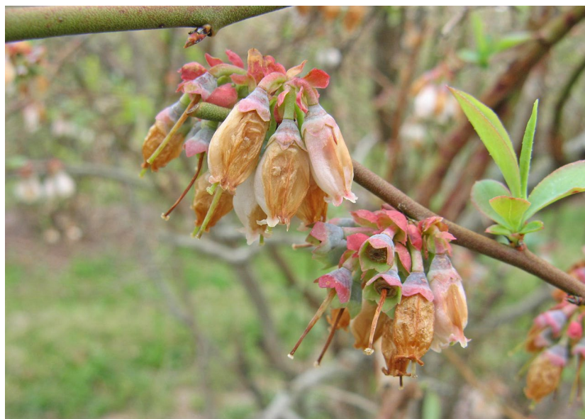
Figure 11. Cold damage to blueberry blooms. These flowers are now susceptible to Botrytis infection that could spread to fruit later in the spring. E. T. Stafne

One of the most recognizable issues is cold injury. Low temperatures during or after bloom can cause damage on flowers ( Figure 11 ) or developing fruit ( Figure 12 ). Fruit scarring on the blossom end is most common. While this may not make the fruit inedible, it can cause it to