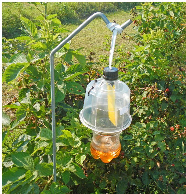
Figure 10. A simple trap with sugar and vinegar can help monitor populations of spotted-wing drosophila (SWD) but will not act as a control measure. E. T. Stafne

Spotted-wing drosophila is a relatively new, nonnative pest of blueberries that can cause significant damage and loss of sales if not controlled. This pest results in leaky berries, fruit rots, fruit drops, and maggot-contaminated produce. Monitor weekly using traps ( Figure 10 ). Begin implementing management programs when berries are full green. Traps can consist of an apple cider vinegar or yeast-sugar mixture bait. Commercial baits are also available. It takes at least one trap per 5-acre block around the field borders and center of field to adequately monitor this pest. Some cultural techniques may help reduce the incidence of SWD, including sanitation, frequent harvesting, and removing culls from nearby packing sheds and fields. These measures may help but are not likely to be enough for adequate control, so chemical control is necessary in most cases. Apply reduced-risk pesticides according to label rates, and rotate chemical classes to prevent resistance build-up in the insect population. Effective control of SWD requires making insecticide applications during the harvest season. Pay careful attention to preharvest intervals and manage harvest schedules, choice of insecticides, and spray schedules appropriately. Populations of SWD generally become problematic