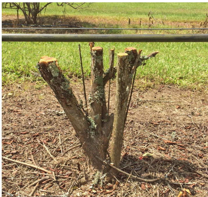
Figure 1. A renovation cut after harvest can help rejuvenate an old, unproductive blueberry bush. E. T. Stafne

A propagation medium that retains moisture well but allows aeration is necessary. Media containing various propagation mixtures of coarse sand, ground pine bark, perlite, sawdust, and peat moss have proven satisfactory. A good rooting medium recipe is a mixture of coarse sand, ground pine bark, and peat moss (1:1:1) or perlite and peat moss (1:1).