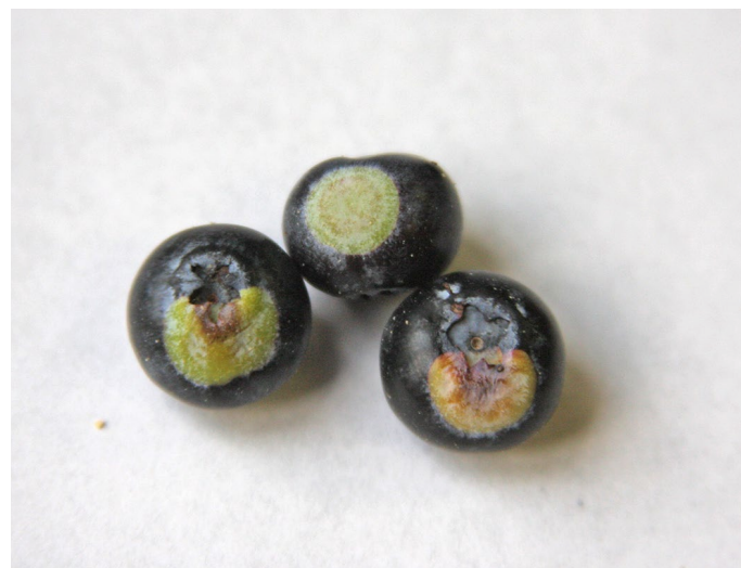
Figure 4. Fruits affected by Exobasidium fruit spot develop light green, circular spots that remain green—even when berries ripen.

This disease is caused by a fungus that infects leaves, fruits, and shoots. On leaves, light green, circular spots develop on the upper surface of leaves, and white fungal mats opposite these spots develop on the lower surface of leaves. Over time, these spots will become brown and necrotic. On fruits, light green, circular spots develop and remain green even when berries ripen ( Figure 4 ). The pathogen may also cause cankers on young shoots that lead to girdling of the shoot. Exobasidium leaf spot appears to be most prevalent in fields with poor airflow and high humidity, often near riparian areas or ponds.