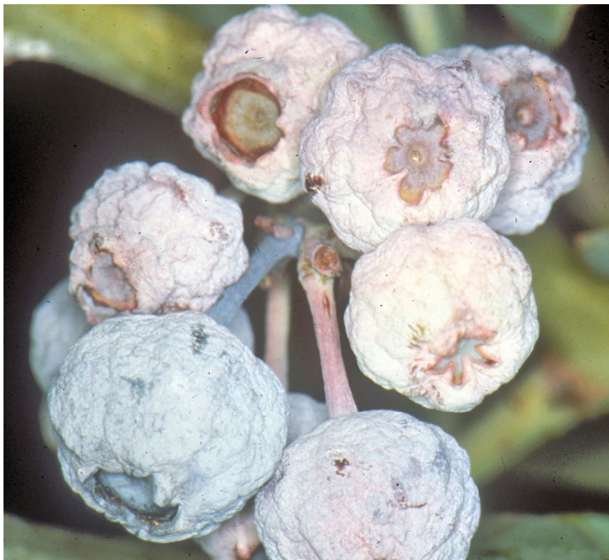
Figure 5. Blueberry fruits with mummy berry disease become pinkish to white, shriveled, and hard as they ripen.

Mummy berry is one of the most potentially devastating blueberry diseases. Symptoms of this fungal disease include shoot blight, flower cluster blight, and fruit mummification. Infected fruits typically remain symptomless on the outside but become pinkish to white, shriveled, and hard as they ripen ( Figure 5 ). Mummified fruit eventually drop to the ground and serve as a source of pathogen inoculum for the following season. A 1-inch layer of fresh mulch can cover mummified fruit under the plants and prevent the mushroom that is produced from reaching the surface and subsequently releasing spores into the air. Mechanical harvesters can carry mummified berries to new sites. Thoroughly clean harvesters that have been in mummy berry-infested fields before moving them into new fields. Apply fungicides from green tip or first bloom (whichever occurs first) and throughout bloom development to manage mummy berry.