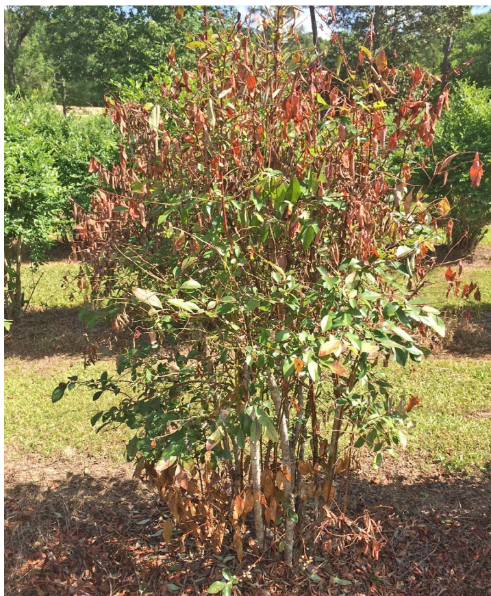
Figure 13. Blueberry bushes are susceptible to damage from systemic, nonselective herbicides. The bush will have a difficult time recovering from this injury. E. T. Stafne

Waterlogging, drought stress, and herbicide injury share common symptoms such as wilting, leaf chlorosis, and marginal leaf burn. Pay close attention to conditions that may have led to these symptoms (rainfall, recent herbicide applications, etc.), and document progression of the problem. Commonly used herbicides such as glyphosate can cause serious plant damage ( Figure 13 ) from which the plant may never recover. It is extremely important to choose the best herbicide for the task and apply it at the proper rates. However, some problems can be corrected if identified early enough.