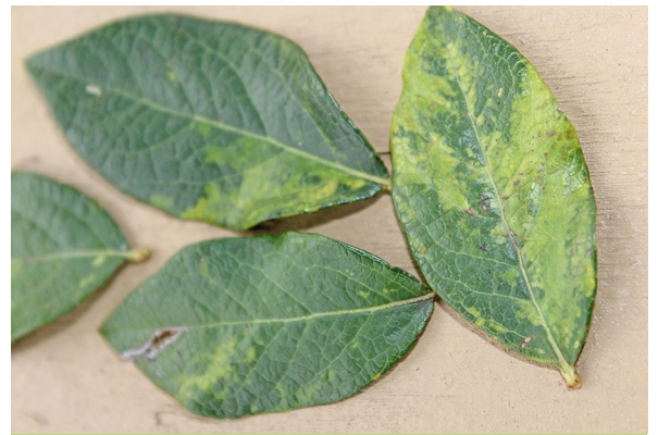
Figure 7. A mosaic on leaves is common in blueberry plants infected with blueberry mosaic associated virus.

highbush cultivars, can cause substantial yield losses in one year due to defoliation but may not be observed the following year. You don't necessarily have to take action if these viruses develop, but it is important to prevent introducing them into new areas. Some viruses introduced from other regions may require the immediate destruction of infected plants. If you observe virus symptoms in blueberry plantings, immediately contact your local county Extension agent or specialist. In general, to avoid introducing viruses into a new or existing planting, only purchase plants that have been inspected for viruses.