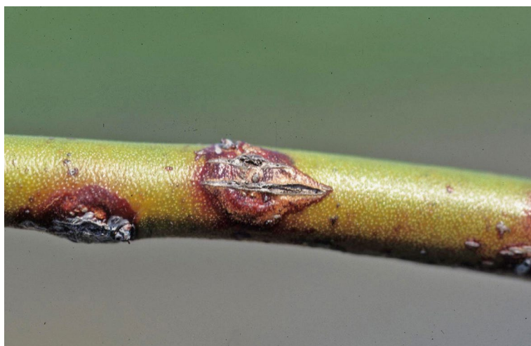
Figure 3. Small, red lesions develop on tender stems of blueberry plants infected with the Botryosphaeria stem canker pathogen.

Symptoms of Botryosphaeria stem canker begin as small, red lesions on tender stems that develop slowly into larger cankers that may girdle and kill stems ( Figure 3 ). Symptoms of stem canker can vary depending on cultivar and blueberry type. The stem canker fungus infects only the current season's growth. Fungicides are typically not effective in managing these diseases. Plant resistant cultivars where these diseases, particularly stem blight, are a problem. Some southern highbush cultivars are classified as being resistant to stem blight and stem canker and others determined to be susceptible; however, many are unknown. Remove and destroy infected branches and stems 6 to 8 inches below diseased wood. If necessary, remove and destroy entire plants. Pruning dead or diseased tissue can be done at any time; however, pruning in the winter may help to reduce disease development since pruning creates wounds that may serve as entry points for the pathogen. Try to avoid wounding plants with farm equipment.