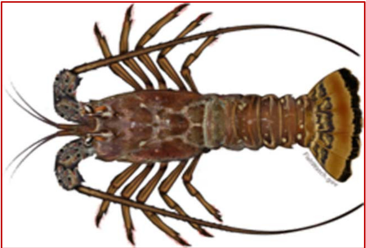
Figure 1. Caribbean Spiny Lobster ( Panulirus argus ). Also known as Crawfish, Rock lobster, Bug, Florida lobster, and Langosta espinosa .

Spiny lobsters are also known as Crawfish, Rock lobster, Bug, Florida lobster, and Langosta espinosa (Figure 1). Spiny lobsters are managed jointly by the Gulf of Mexico and South Atlantic Fishery Management Councils, and the area of management is from the Mexico/Texas border to the North Carolina/Virginia border. According to the 2010 stock assessment, the population status of the South Atlantic/Gulf of Mexico spiny lobster stock is unknown due to too much uncertainty in the data, but the stock is not subject to overfishing based on 2016 catch data.