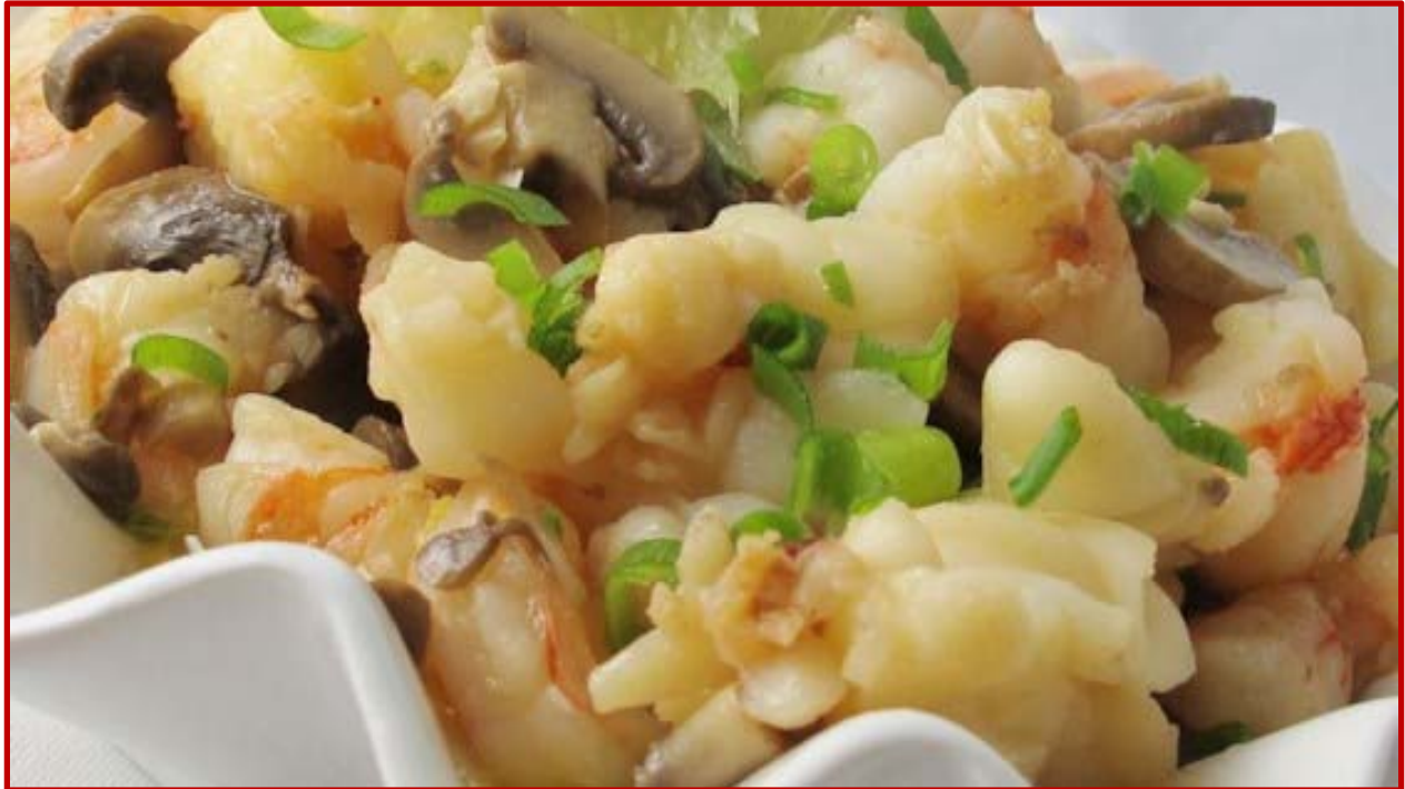
Figure 3. This recipe is courtesy of Allrecipes . For ingredients and cooking instructions, please visit their website at https://www.allrecipes.com/recipe/219982/key-west-pink-shrimp-and-florida-spiny-lobster-tails-served-with-hot-key-lime-butter/ .

Key West Pink Shrimp and Florida Spiny Lobster Tails served with Hot Key Lime Butter