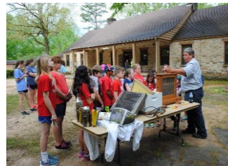
Pollination and Honey Bees

The weather was absolutely spectacular that day, and it was a joy to be outside with so many eager faces wanting to know more about bees. This was the first year for the event, but the enthusiasm by kids and the instructors ensured that the park will likely make this an annual event.