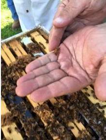
Queen in hand

help people in the Natchez area who wanted to start beekeeping.