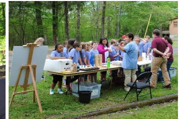
Termites & Wood Products