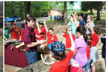
Furs and Hides