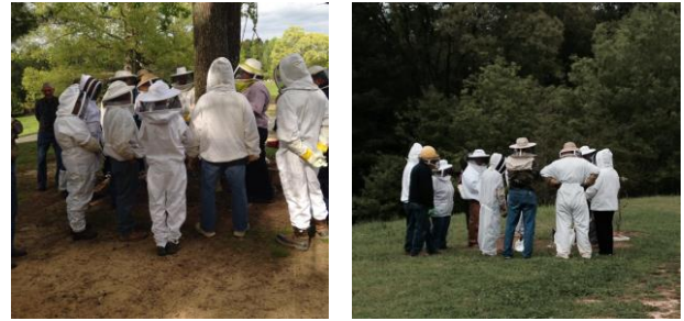
Beekeepers in Mooreville

mites, and any topic that was asked by our beekeeper audience.