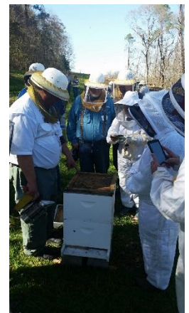
In the Bee Yard

The rest of the afternoon was spent outside. We subdivided the group into smaller sets that were led by seasoned members of the SWBA. Attendees were shown the basics of how to work honey bees, and we discussed the kinds of things that one should be looking at when inspecting hives. These segments of workshops are always the best because they seem very spontaneous and natural as questions are asked by eager participants. The hands-on approach allowed us to demonstrate techniques while responding to queries from the new beekeepers. This approach feels the most rewarding to me.