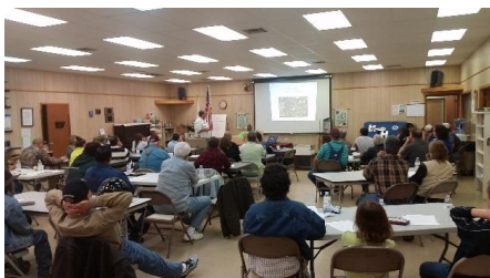
Lecture in Adams Co. Extension Office

I followed with a seminar on getting started in beekeeping. Specific topics included how and where to obtain bees, how to choose apiary