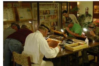
Attendees being taught to graft

Meanwhile, I showed how old blind folks like me could use a cell punch to obtain a bee larva or egg without having to lift it out of the cell with other tools. I also showed the Miller and Hopkins methods under field conditions. We are likely to repeat this workshop because it is one of the most frequently requested topics. So, look for future announcements as we approach September and October.