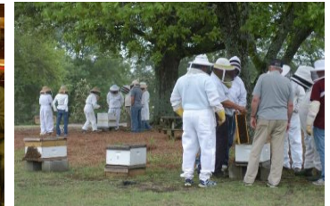
Outdoors with different types of cell builders

MSU Department of Biochemistry, Molecular Biology, Entomology and Plant Pathology