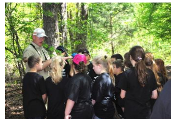
Tips on Viewing Wildlife