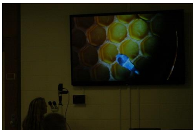
Audrey showing a 1-day old larva using a video camera

The formal indoor lectures included two additional power point slide shows. Audrey Sheridan, Research Associate, described the basic principles of grafting. She highlighted several types of cell builder-finisher combinations, and she also discussed the various tools needed for the grafting technique. She also demonstrated the correct size of larvae to graft by