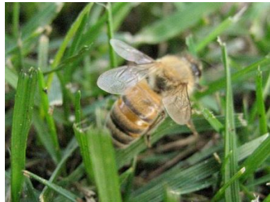
Foragers with K-wings cannot fly and fall into grass in front of hive

I took a subset of workers home with me, and I did find tracheal mites in his bees. This may seem unusual, but it appears that many people have elected to no longer treat colonies of bees for Varroa mites. The result has been an increase in colonies suffering from tracheal mites – this suggests that the treatments against Varroa mites have also been controlling tracheal mites. I am not sure if the individual who provided the sick bees had been treating for Varroa mites, but it was a little unusual to see tracheal mites in high levels.