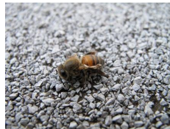
This bee is infected with Deformed Wing Virus, one of many viruses spread by varroa mites.

Honey bee colonies in the United States are in decline, due in part to the ill effects of voracious mites, fungal gut parasites and a wide variety of debilitating viruses. Researchers from the University of Maryland and the U.S. Department of Agriculture recently completed the first comprehensive, multi-year study of honey bee parasites and disease as part of the National Honey Bee Disease Survey. The findings reveal some alarming patterns, but provide at least a few pieces of good news as well.