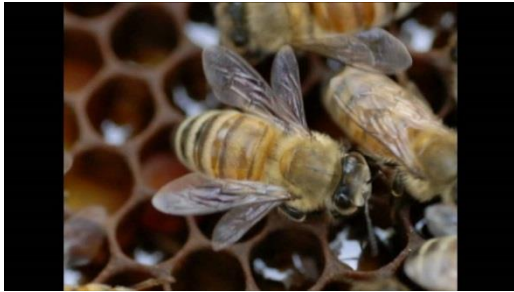
Wings of worker bee uncoupled after infection by tracheal mites

Prior to the meeting in Aberdeen, we briefly examined a couple of hives outside. I discussed installing a nuc and growing it into the summer dearth. We also had a participant beekeeper bring a colony that was dying from unknown causes. This was a great impromptu moment. Many of the workers in his colony were displaying K-wings, which is a classic symptom of tracheal mites.