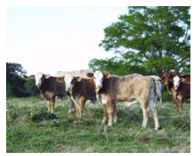
The 2010 Mississippi calf crop was down 5\% from 2010.