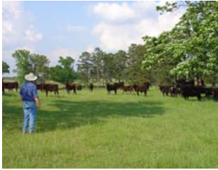
Mississippi beef cattle producers can easily take advantage of this free program