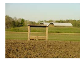
Free choice minerals are up for grabs for the April prize