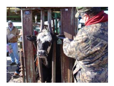
Radio frequency identification technology is used to manage the MAFES beef herds

Questions such as "Why is a National Animal Identification System needed?", "What are the benefits for producers to participate in the NAIS?", "How much will the program cost?", "Where do producers get premises identification numbers?", "What forms of identification are used?", "Who will have access to information in the NAIS databases?", "If a producer is currently using an identification program through a private sector or marketing allinace, will that identification be usable in the NAIS?" and many others are answered on the website.