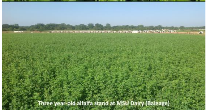
Three year-old alfalfa stand at MSU Dairy (Baleage)