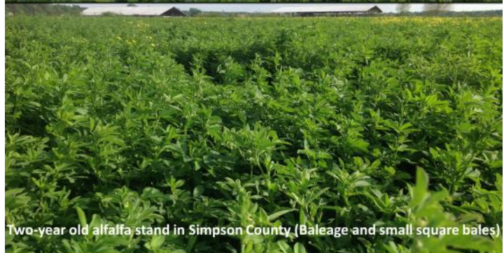
Two-year old alfalfa stand in Simpson County (Baleage and small square bales)