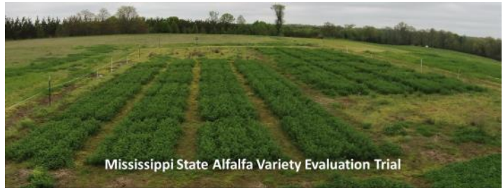
Mississippi State Alfalfa Variety Evaluation Trial

The establishment and persistence of an alfalfa field will also depend on good soil fertility. Before thinking about planting alfalfa, soil samples should be taken (0-6 inches) at least six months ahead of the planting time. This will allow proper time to start correcting nutrient deficiencies and neutralizing soil acidity. Incorporating the lime and fertilizer into the root zone will promote rapid germination and root development. It is recommended to apply recommended lime rates based on the neutralizing value of the lime and to in-