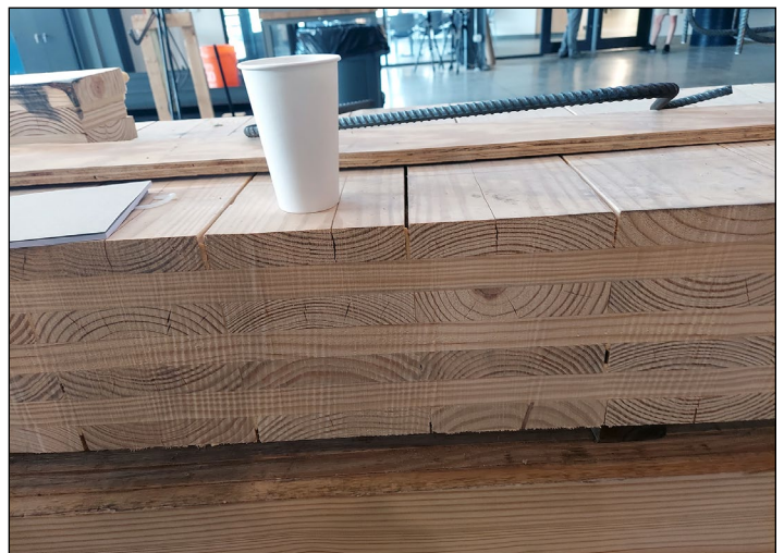
Figure 2. These are examples of a five-layer/ply piece (left photo) and a seven-layer/ply piece of cross-laminated timber (right photo). Notice the cross-directional, 90-degree joining of the layers/plies. For the seven-layer/ply picture, the cup provides a reference to demonstrate the thickness of the CLT piece.