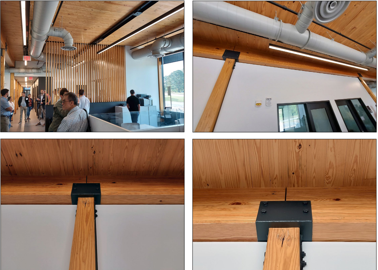
Figure 5. In the Auburn University Advanced Structural Engineering Lab, CLT was used for roofing (five-layer/ply, 10 feet in length). Glulam was used for the beams, and solid timbers were used for the framing. Unlike CLT—in which layers of several pieces of lumber are glued to produce a layer and then layers are joined in a 90-degree, cross-oriented fashion—glulam is made of pieces of lumber laid in the same direction and then joined. Solid timbers are single pieces of wood and are not engineered by joining several pieces. Therefore, the Structural Engineering Lab is an example of a mass-timber-constructed building, not a CLT-constructed one specifically.