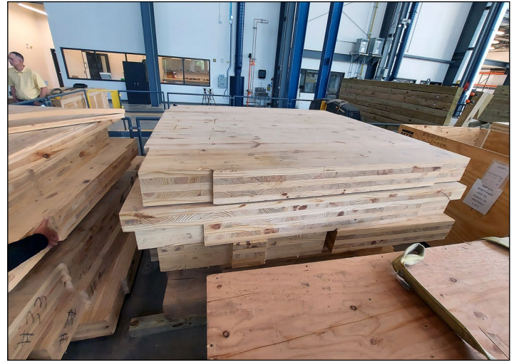
Figure 3. These are pieces of five-layer/ply cross-laminated timber.

In the U.S., most CLT construction has not used southern yellow pine. Other species include Douglas-fir, grand fir, western larch, Sitka spruce, and lodgepole pine, among several other western U.S. conifer species. Due to the high cost of transportation, it is difficult to ship CLT across the country, which has limited the amount of CLT construction in the Southeast. However, there are two new large-scale production facilities in the region: SmartLam in Dothan, Alabama, and Structurlam in Conway, Arkansas. These facilities will substantially increase the feasibility of using southern yellow pine CLT for building projects in the Gulf region. Additionally, a smaller operation called Texas CLT located in Magnolia, Arkansas, produces custom-built CLT pieces.