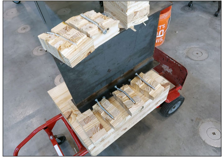
Figure 4. When using mass timber in construction, including CLT, concerns about stability and strength are not only about the pieces of wood themselves, but also the fasteners used to join the pieces of CLT.

Another issue is that there is a limited number of work crews familiar with mass-timber construction in general but CLT in particular. Currently, the supply of CLT material can be problematic, and there are only two large-scale processing facilities in the Southeast. These issues create problems with product availability and transportation costs. However, if CLT becomes more popular over time, the number of facilities will likely increase. Several other companies have already announced their intention to produce CLT using southern yellow pine lumber. Variations in the grade of lumber and CLT can also result in varying prices.