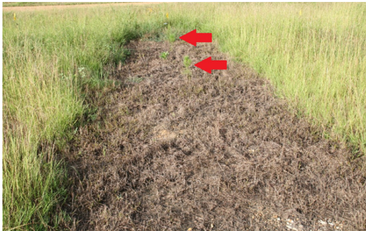
Figure 4. Typical grass control resulting from an application of Select (clethodim). Note grass control and lack of damage to loblolly pine seedling.

Currently, the two grass herbicides most commonly encountered in landscape application are fluazifop-P-butyl (Fusilade) and clethodim (Select). Properly implemented ground applications of these products will not result in damage to woody species. However, drift contact with leaves can result in damage if crop oil is used as a surfactant. Crop oil coming into contact with woody foliage will cause leaf browning but rarely mortality.