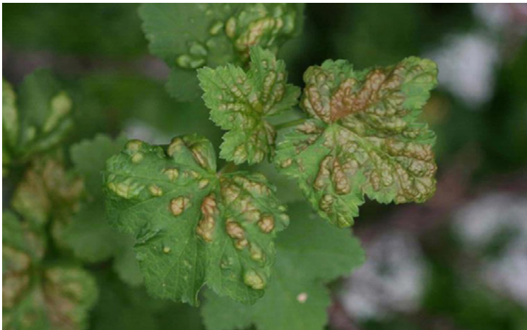
Figure 9. Leaf blistering.

Abnormal cell division in plant tissue that leads to the appearance of blisters or puckering on leaf surfaces.