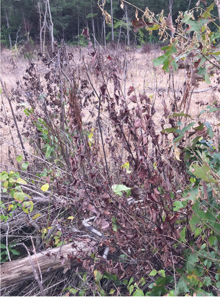
Figure 11. Herbicide-induced necrosis of red maple leaves.

Browning and desiccation of plant tissue caused by tissue death. Often starts as watery lesions leading to tissue desiccation and subsequent death of affected tissues.