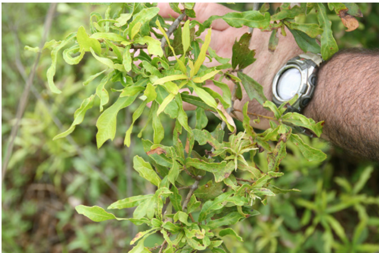
Figure 3. Twisting and abnormal growth of foliage characteristic of growth-regulator herbicides.

Dicamba (Banvel), is often used to control resistant species of broadleaf weeds in turf applications. It is also sometimes recommended to control woody species in rights-of-way, along fence lines, and for “clean-up” in non-cropland settings. While rates of dicamba commonly prescribed for use in landscape applications rarely cause woody species mortality, the herbicide is absorbed through the root systems of these species. This typically results in minor damage (easily observable in the form of leaf deformation and twig/branch dieback), but it can result in serious injury and/or mortality if dicamba is applied at greater than recommended rates and/or in repeated applications inside the root zone of woody species.