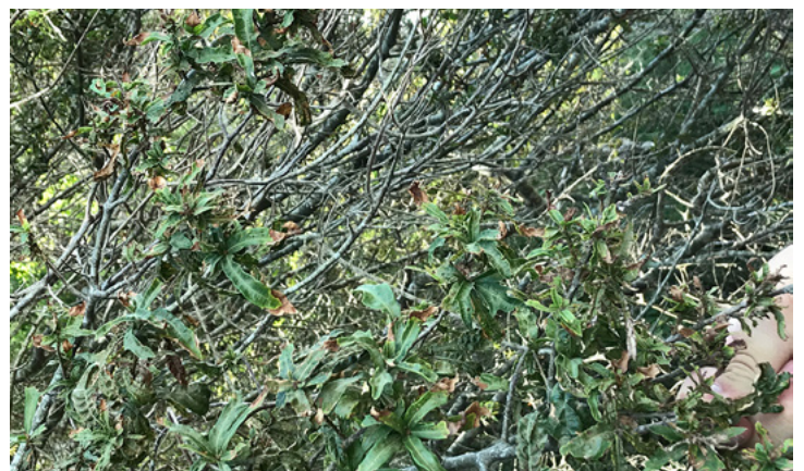
Figure 7. Epinastic growth of water oak leaves.

Abnormal development of plants caused by faster growth of tissue on the upper portion of stems and petioles causing bending, twisting, cupping, or other distortion.