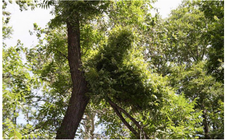
Figure 12. Witch's broom.

Deformity where a dense mass of shoots emerges from a single point. The resulting shoot mass resembles a broom.