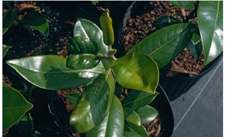
Figure 10. Cupping on southern magnolia leaves.

Abnormal leaf development in which leaf tissue produces a cupped appearance.