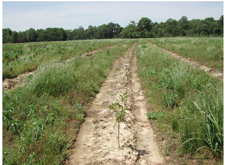
Figure 1. Control of herbaceous vegetation through the use of Oust XP (sulfometuron methyl). Note nearly complete herbaceous control and absence of damage to hardwood seedlings.

The herbicides listed below are commonly used in lawn settings to control a variety of undesired annual grass and broadleaf species. These herbicides include indaziflam (Specticle), pendimethalin (Pendulum), simazine (Princep), atrazine (Aatrex), prodiamine (Barricade), and dithiopyr (Diminon). When applied correctly, woody species have very little root uptake of these herbicides. In addition, these herbicides are applied as pre-emergent treatments (before foliage appears) when most woody species are dormant. Subsequently, use of these herbicides does not typically result in tree or shrub damage. Always be aware of label cautions regarding soil pH, texture, and other factors that may be a concern when susceptible woody species are present.