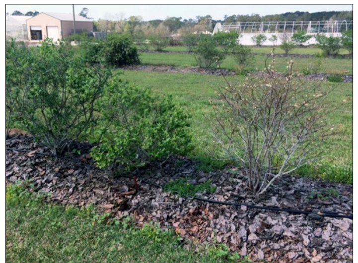
Figure 1. From left to right: Springhigh, Jewel, and O'Neal southern highbush blueberries. Notice that O'Neal has no leaves, but Springhigh and Jewel do. This is likely because O'Neal did not get the required chilling hours for leaf buds to emerge. Photo taken in Poplarville, Mississippi in 2016.

Typically, temperatures between 32°F and 50°F can help fulfill the chilling requirement of many plants, but the most efficient temperatures for satisfying a plant's need for cold are between 32°F and 45°F. When temperatures dip below 32°F, very little, if any, chilling is received by the plant. Conversely, when temperatures exceed 60–70°F for extended periods, chilling can be negated. Interestingly, leaf and fruit buds on the same plant can have different chilling requirements ( Figure 1 ). Insufficient chilling can lead to various problems,