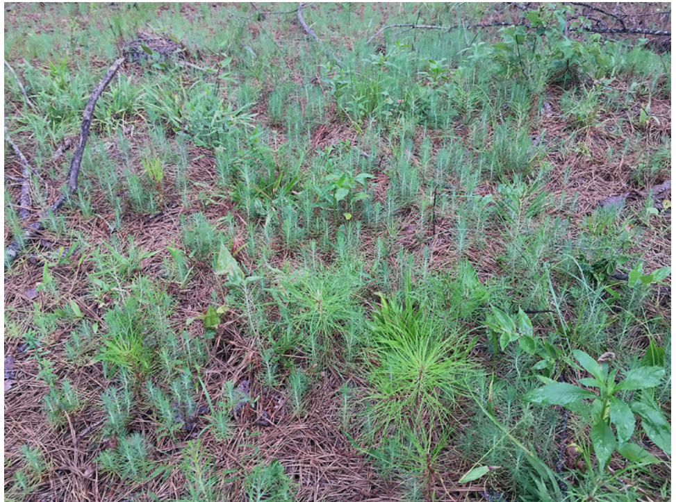
Figure 3. Young pine seedlings in a seed-tree cut.

As soon as adequate density and stocking of regeneration is achieved, remove seed trees. If they are not removed, they will have a negative impact on development of established regeneration. Further, they will continue to disseminate seeds across the area, and that can cause an overstocking of seedlings.