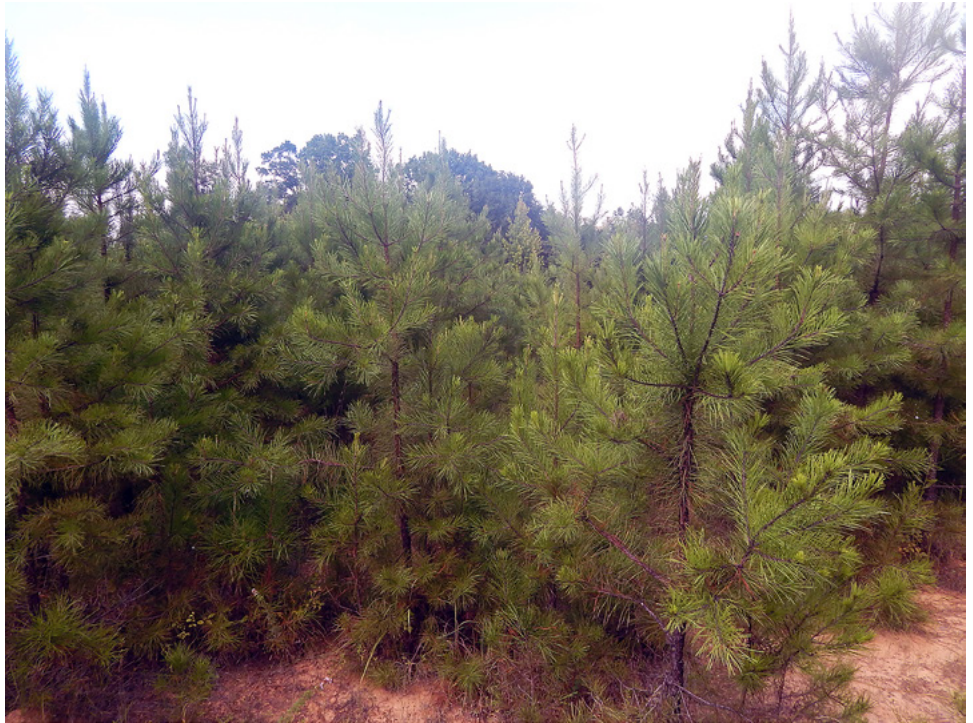
Figure 4. Adequate regeneration in a 3-year-old seed-tree attempt.

Seed trees are highly vulnerable to windthrow once they are left with no surrounding vegetation. The method works best in areas of fairly level topography with adequate soil moisture during the growing season for seedlings to survive and develop.