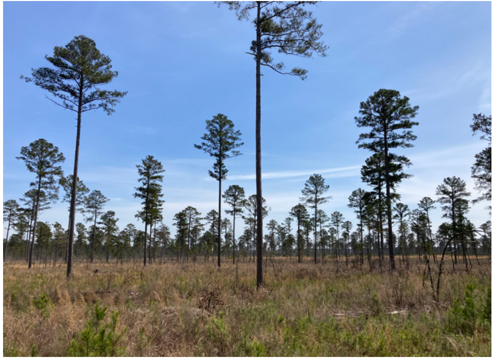
Figure 2. Seed-tree harvest.

Species such as oak and black walnut have seeds far too heavy to be spread by wind. For this reason, seed-tree harvesting is not a good choice for regenerating most desirable southern hardwood species.